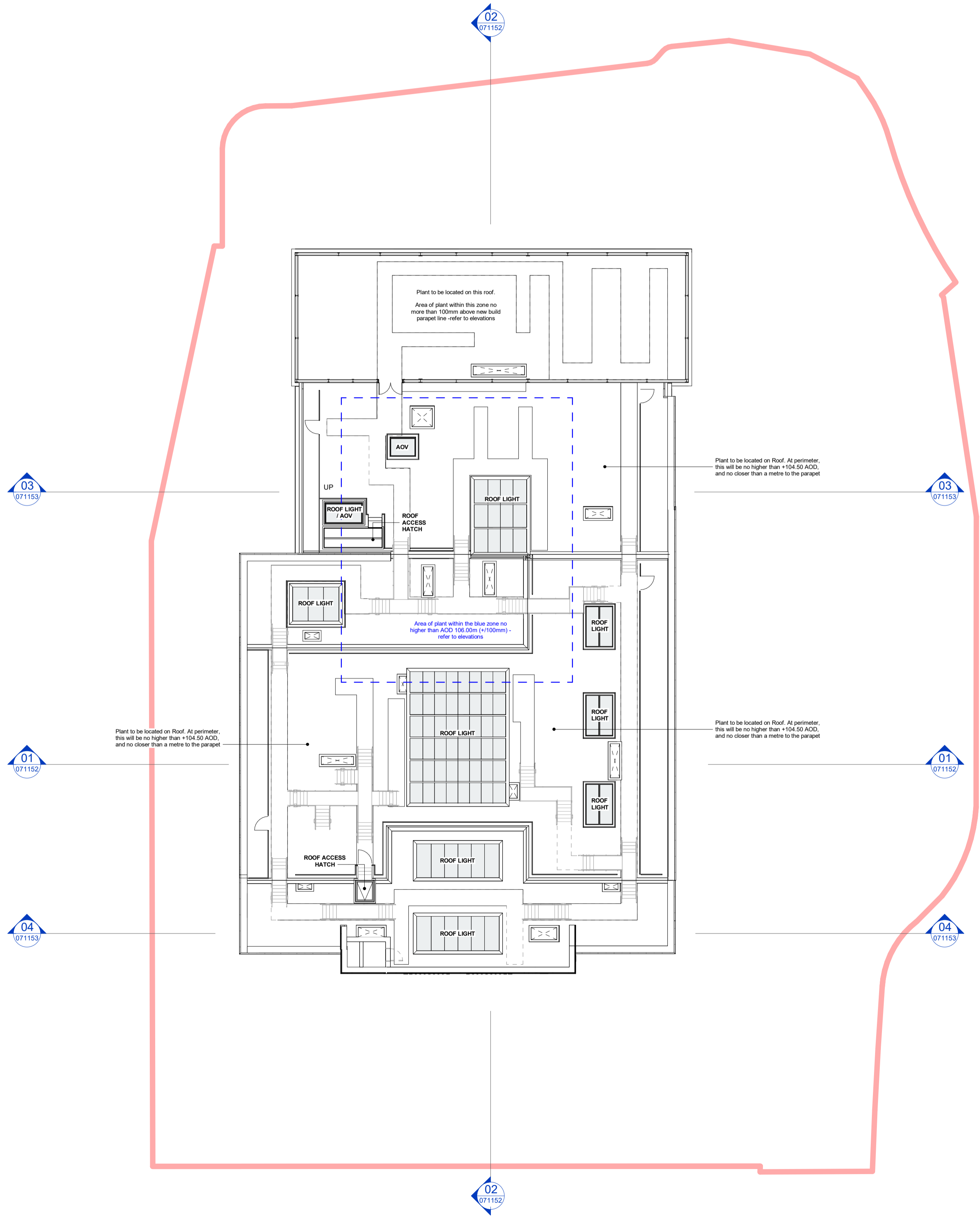
Proposed Plan - Roof Level 1 : 200

THIS DRAWING MUST NOT BE SCALED. ALL DIMENSIONS ARE TO BE VERIFIED AND CHECKED ON SITE. ANY DISCREPANCIES THAT ARE, OR BECOME APPARENT SHOULD BE REPORTED TO CHAPMAN TAYLOR. AREAS INDICATED ARE APPROXIMATE GROSS INTERNAL AREA. THEY RELATE TO THE LIKELY AREAS OF THE BUILDING AT THE CURRENT STAGE OF DESIGN. ANY DECISIONS TO BE MADE ON THE BASIS OF THESE PREDICTIONS, WHETHER AS TO PROJECT VIABILITY, PRE-LETTINGS, LEASE AGREEMENTS, OR THE LIKE, SHOULD INCLUDE DUE ALLOWANCE FOR THE INCREASES AND DECREASES INHERENT IN THE DESIGN DEVELOPMENT AND BUILDING PROCESS. © COPYRIGHT CHAPMAN TAYLOR 2022