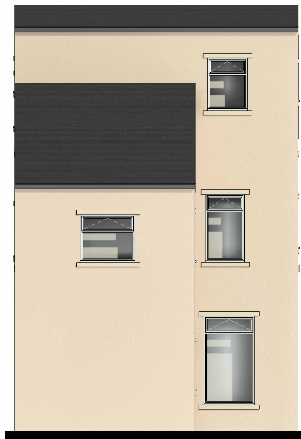
3 Existing West Elevation 1 : 50