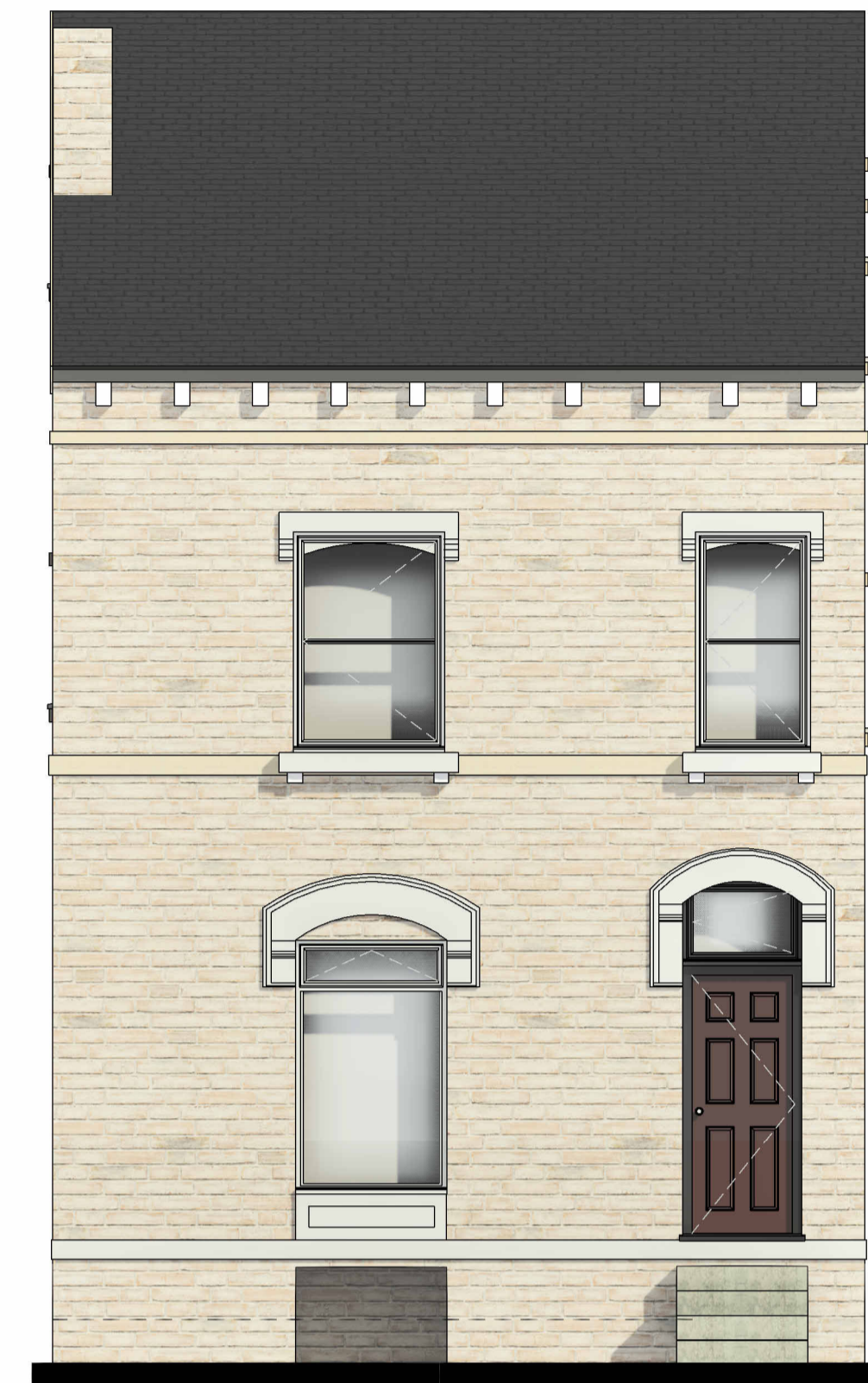
2 Existing East Elevation 1 : 50