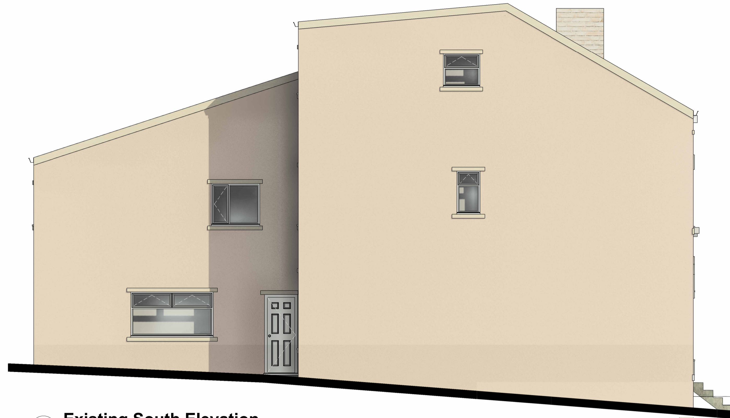
1 Existing South Elevation 1 : 50