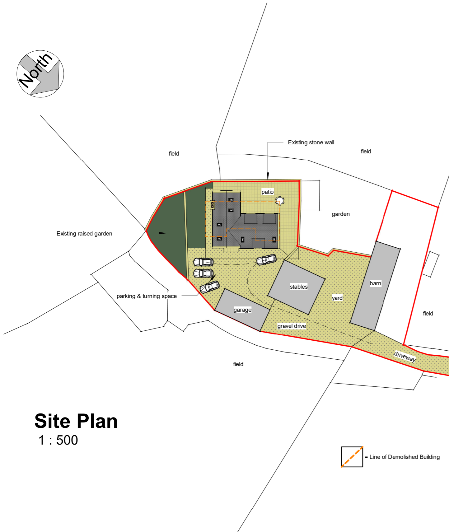
Site Plan 1 : 500