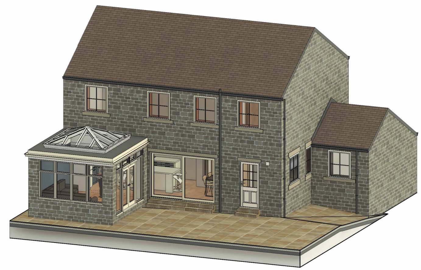
2 14 Rear Isometric