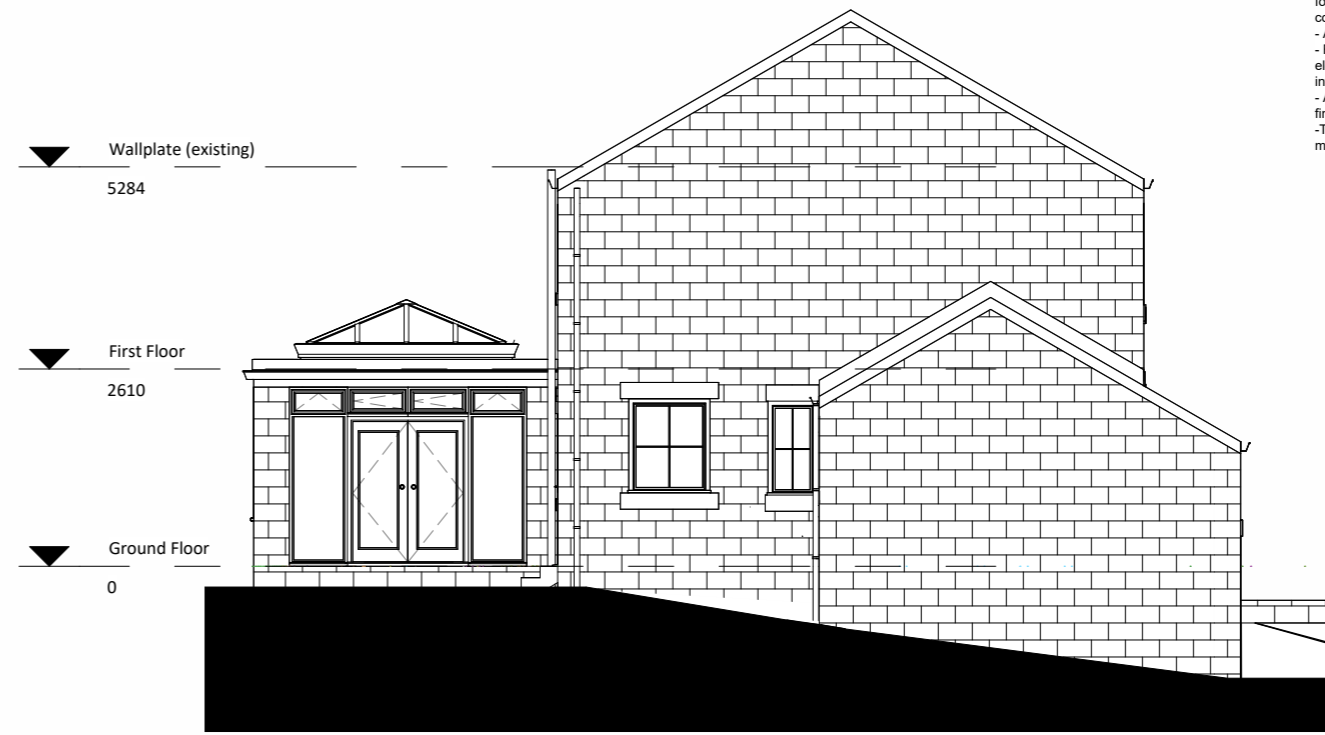
2 11 Proposed North (Side 2) 1 : 100