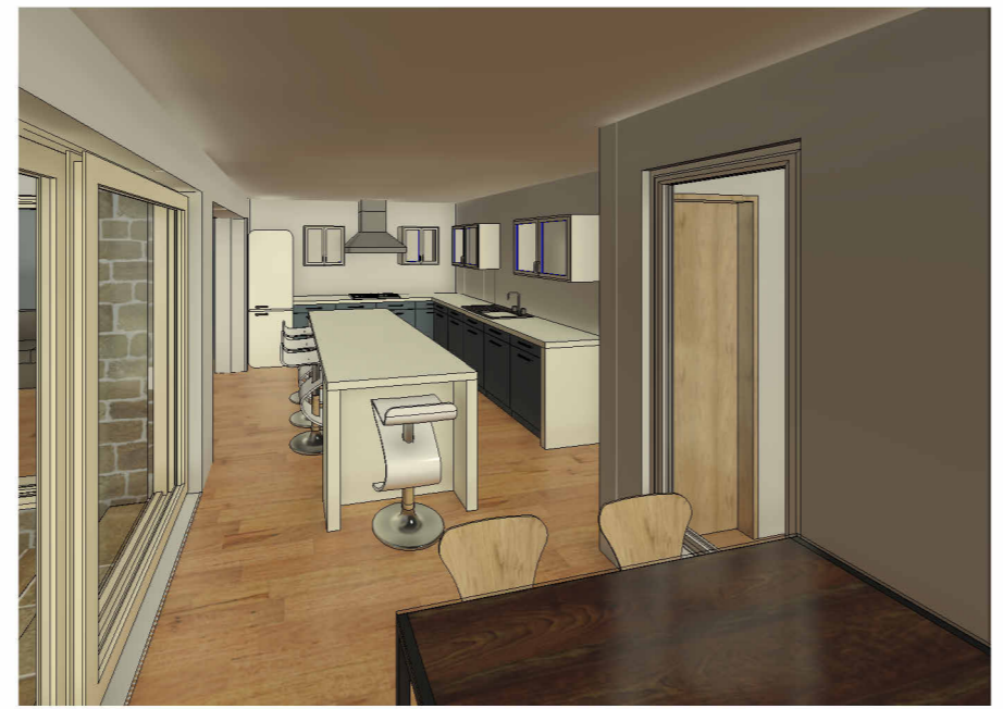
CGI KITCHEN 1