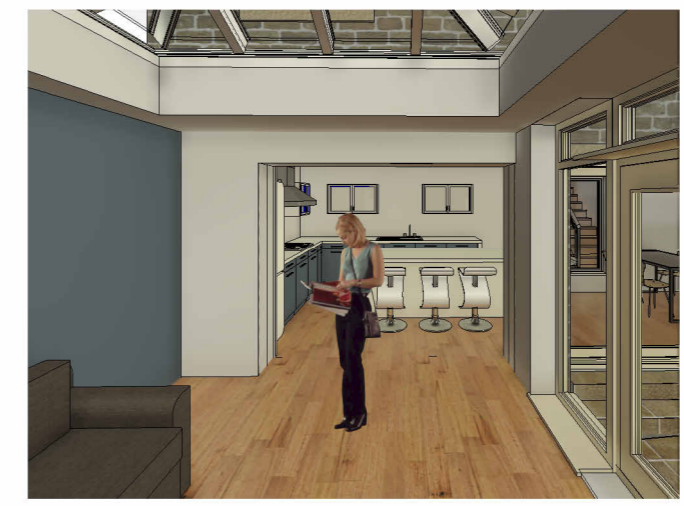
CGI FROM SUNROOM