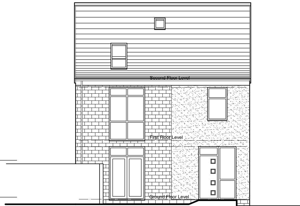
South East Elevation (front)