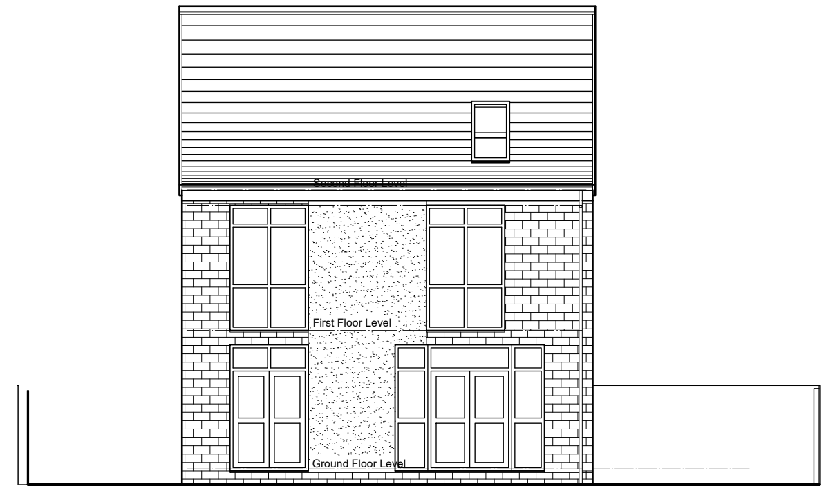
North West Elevation (rear)