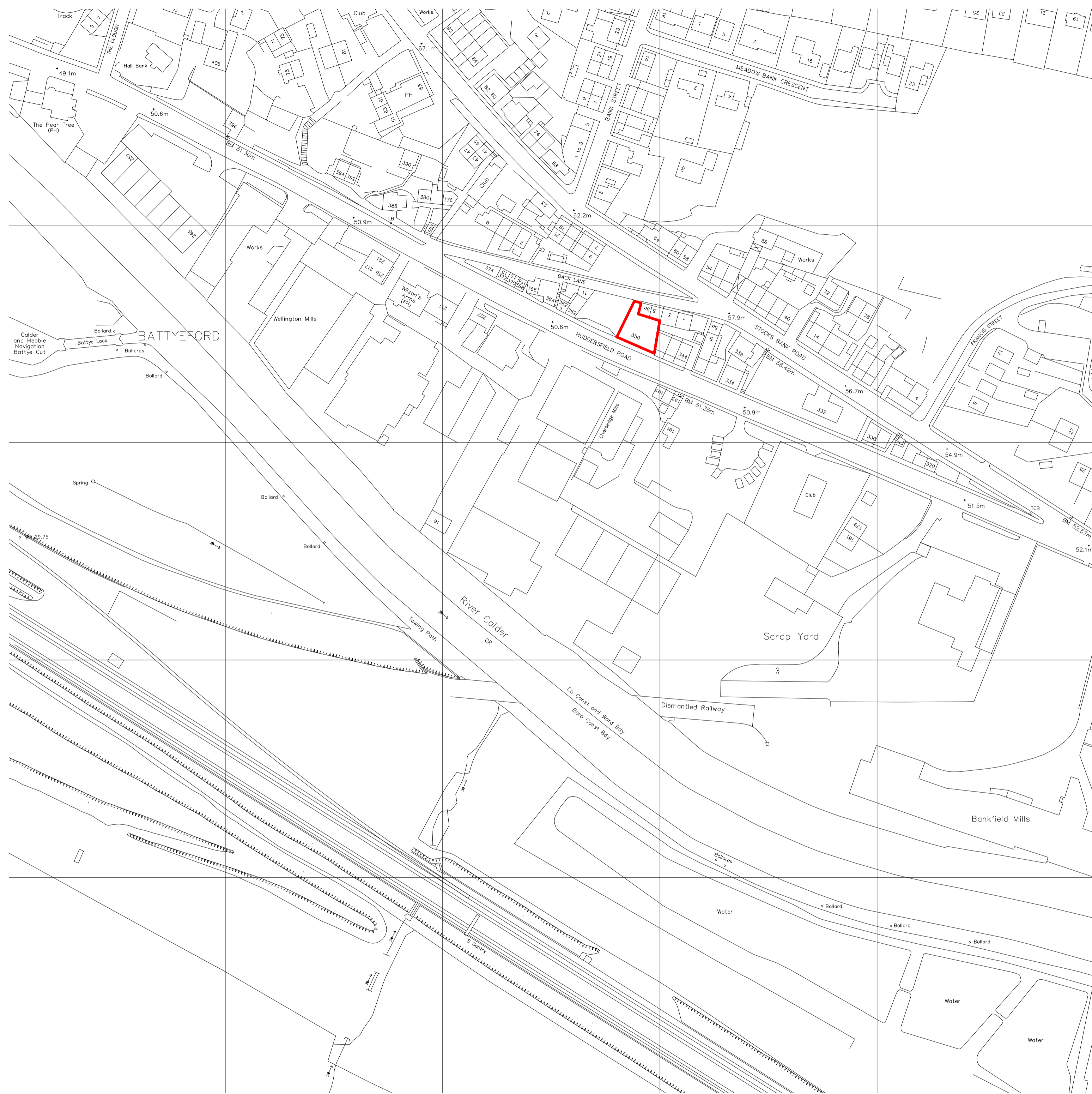
LOCATION PLAN at 1:1250

Drawings illustrate design intent only and are to be read in conjunction with all other specialist/relevant contractor/engineers drawings & calculations etc. Any and all discrepancies with this drawing are to be reported to the Designers and or Project Manager before the work is initiated. Drawings based on Ordnance Survey and or existing record drawings are subject to Site Survey, Structural Survey, Site Investigations, planning and Statutory Requirements and Approvals. Main Contractor must verify all dimensions on site before commencing any work or shop drawings. Only figured dimensions to be taken from this drawing. Do not scale off this drawing.