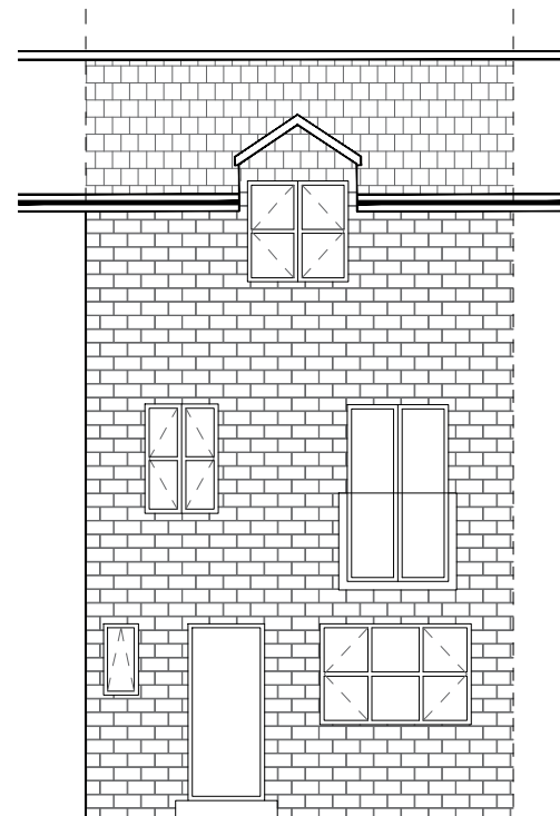
PROPOSED FRONT ELEVATION (North West)