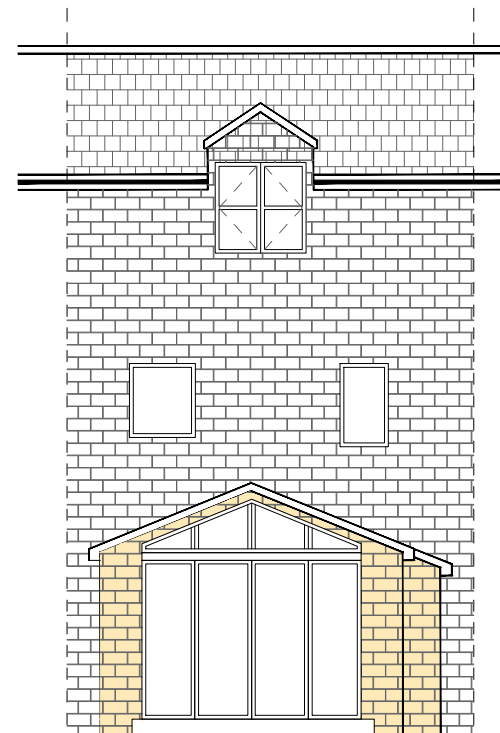
PROPOSED REAR ELEVATION (South East)