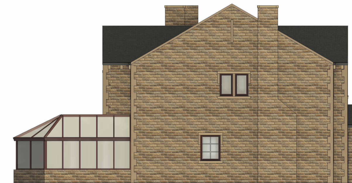
6 Existing South-East Elevation 1 : 100