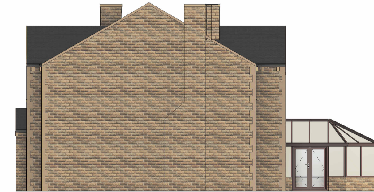
4 Existing North - West Elevation 1 : 100