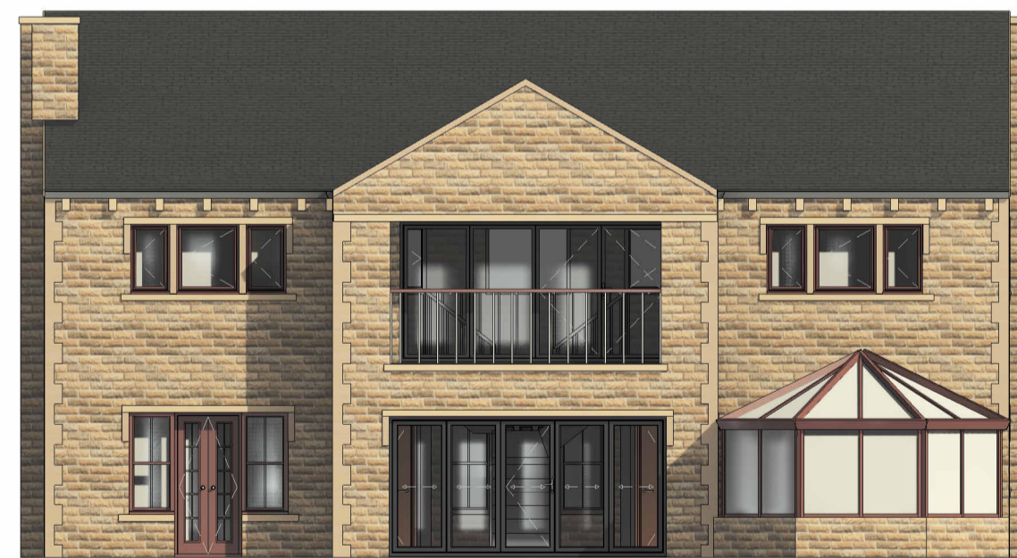
5 Existing Rear Elevation 1 : 100