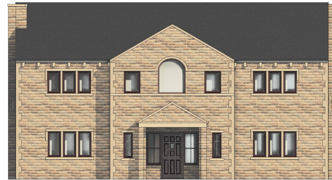
3 Existing Front Elevation 1 : 100