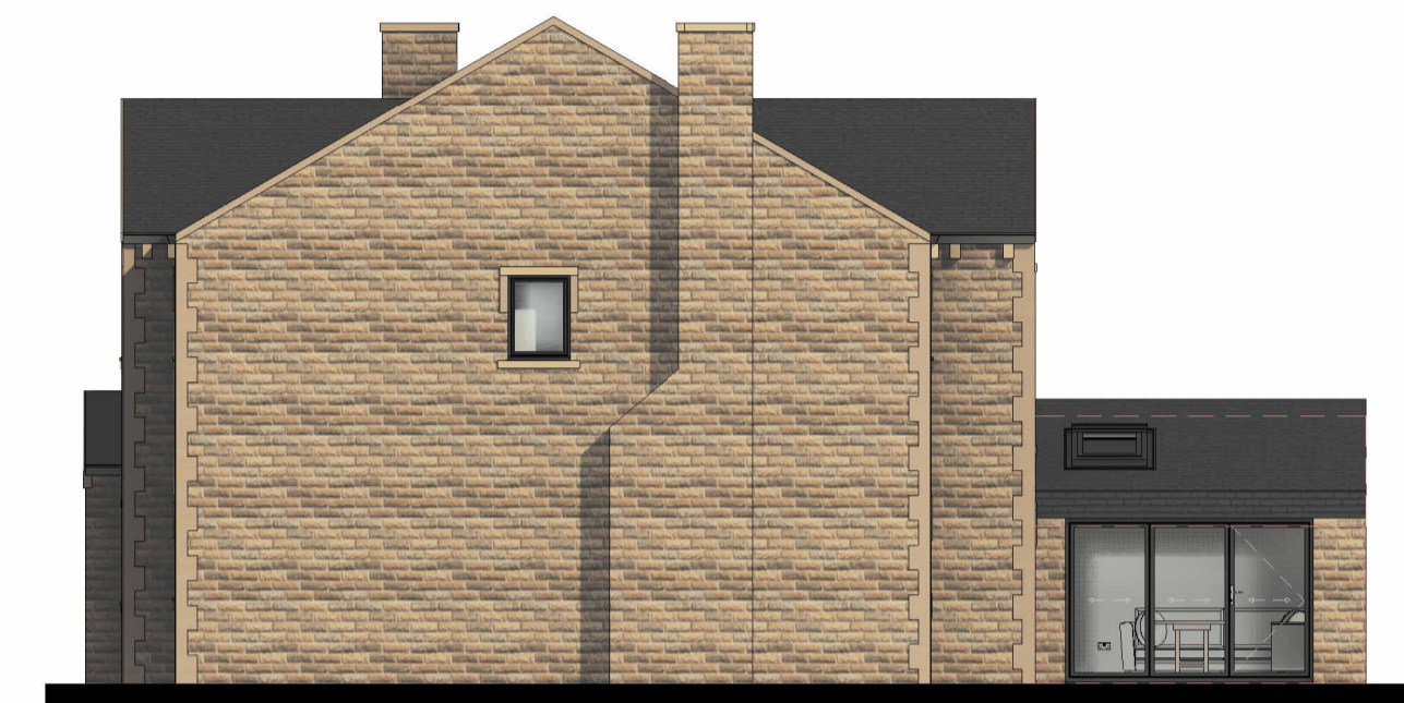
4 Proposed North - West Elevation 1 : 100