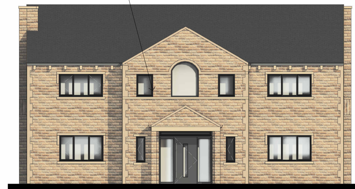
3 Proposed Front Elevation 1 : 100

Replacement windows to be uPVC colour: black. Escape windows to be provision on second floor habitable rooms.