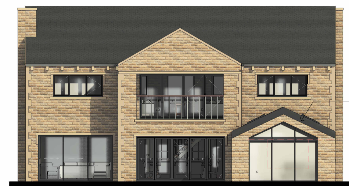
5 Proposed Rear Elevation 1 : 100

New gable roof construction and supporting columns