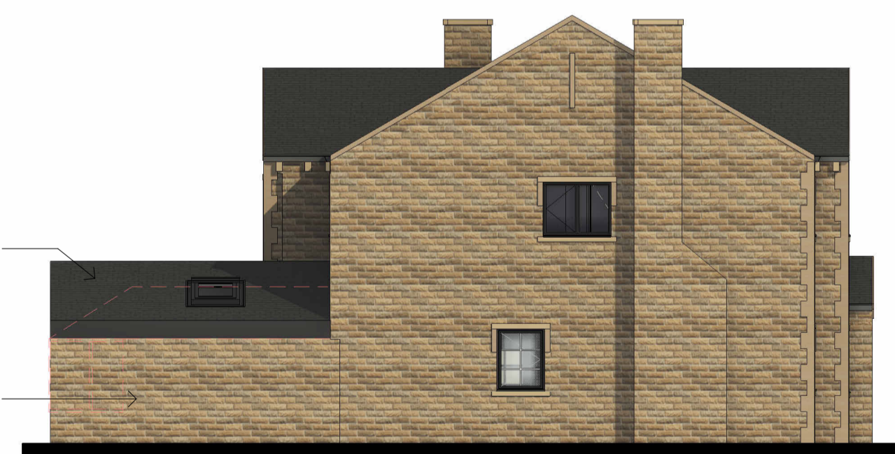
6 Proposed South-East Elevation 1 : 100