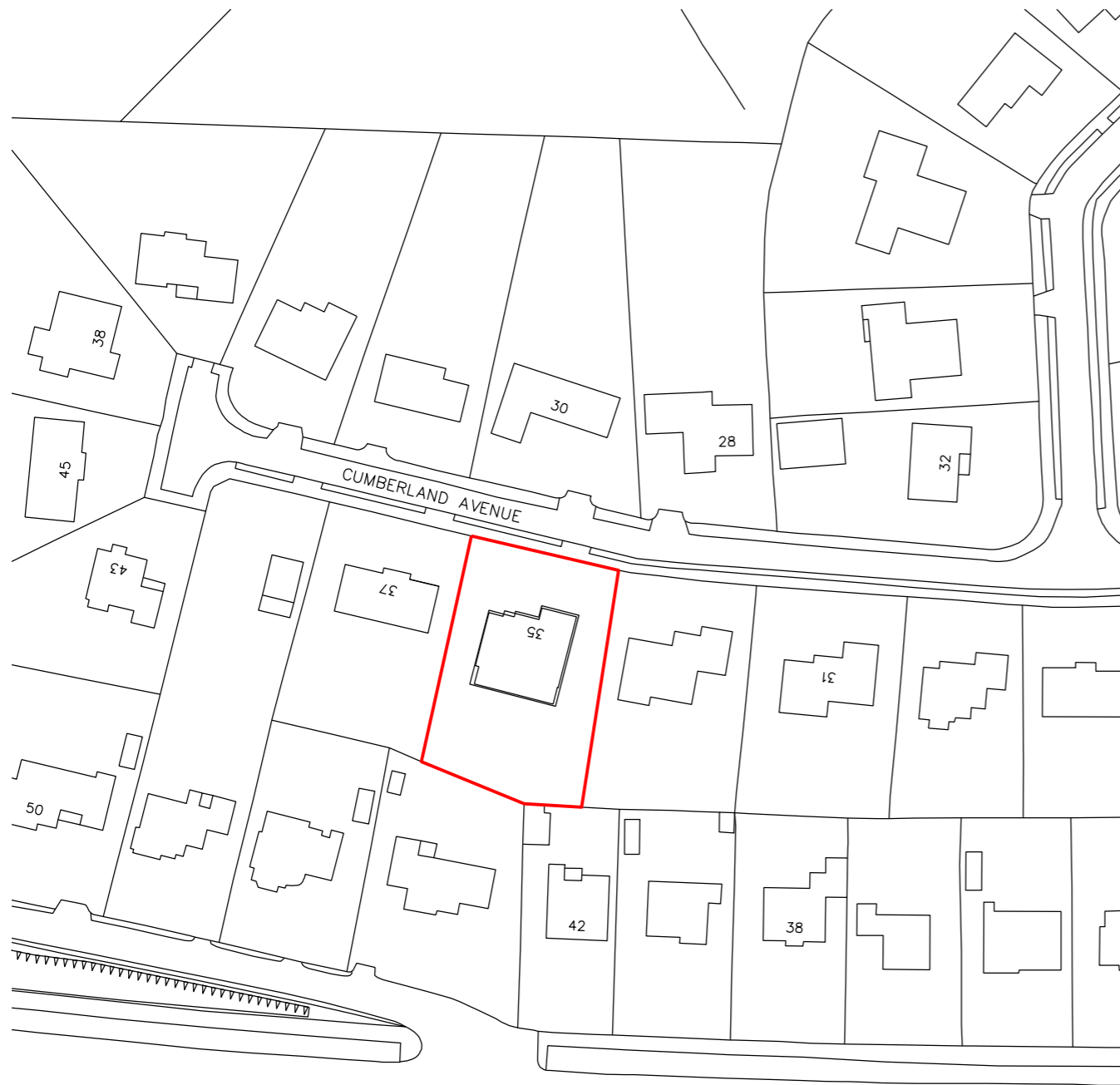
LOCATION PLAN 1:1000 / A3