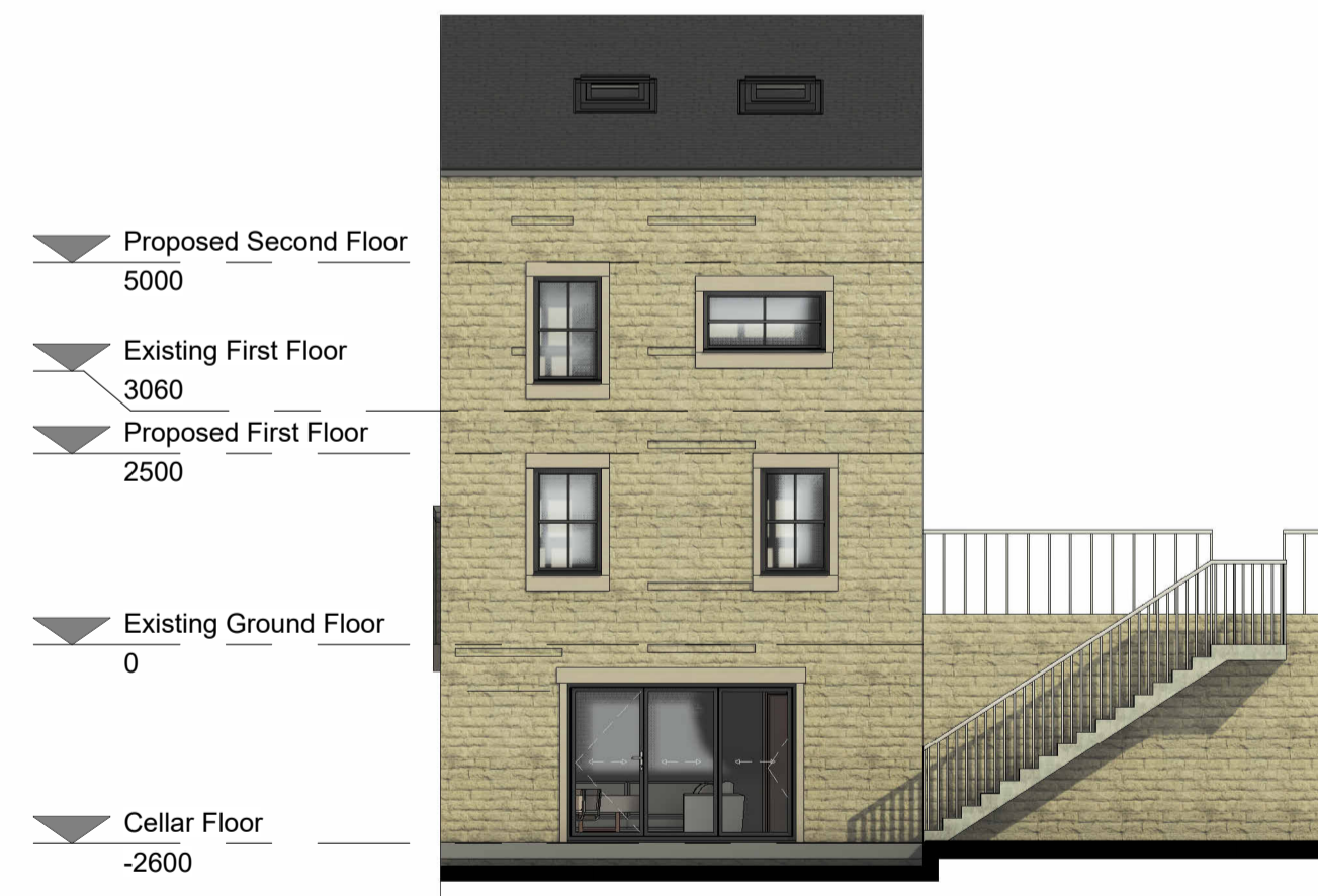
3 Proposed South Elevation 1 : 100