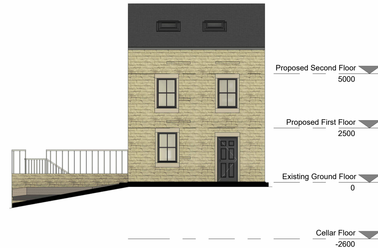
2 Proposed North Elevation 1 : 100