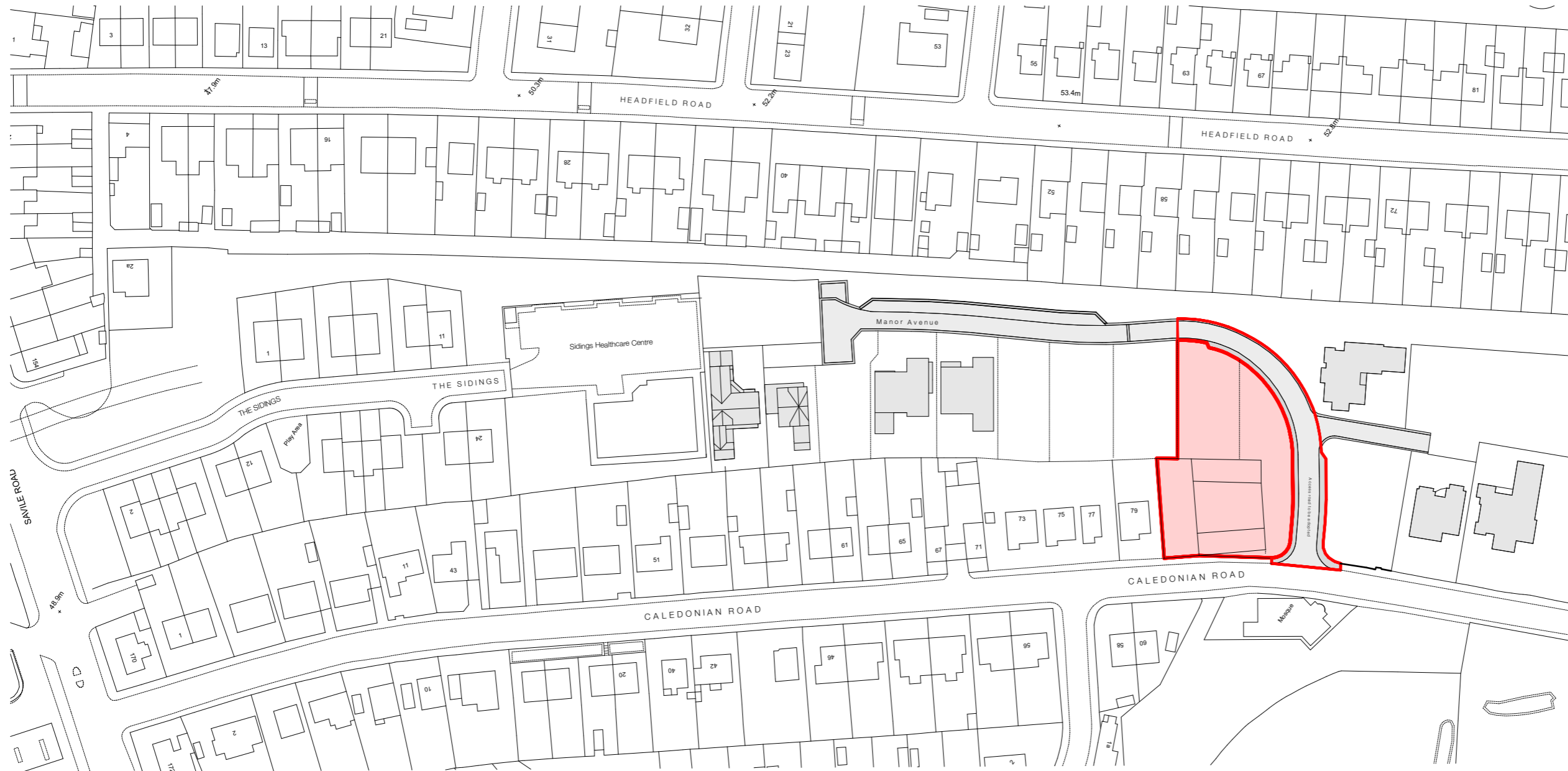
OS Location Plan - 1:1250