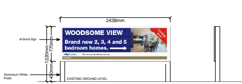
PROPOSED SIGN 1 FRONT ELEVATION SCALE 1:50