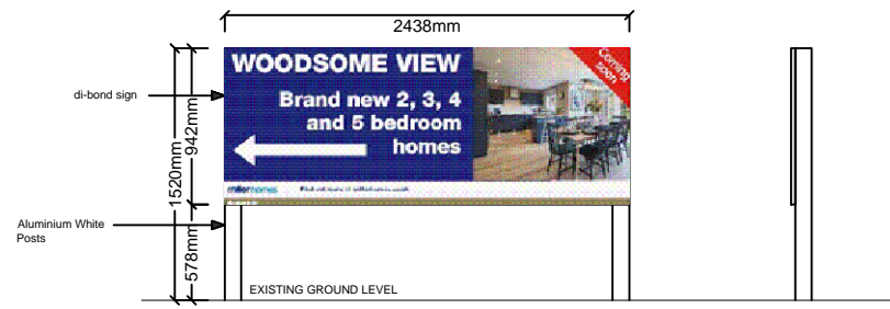
PROPOSED SIGN 2 FRONT ELEVATION SCALE 1:50