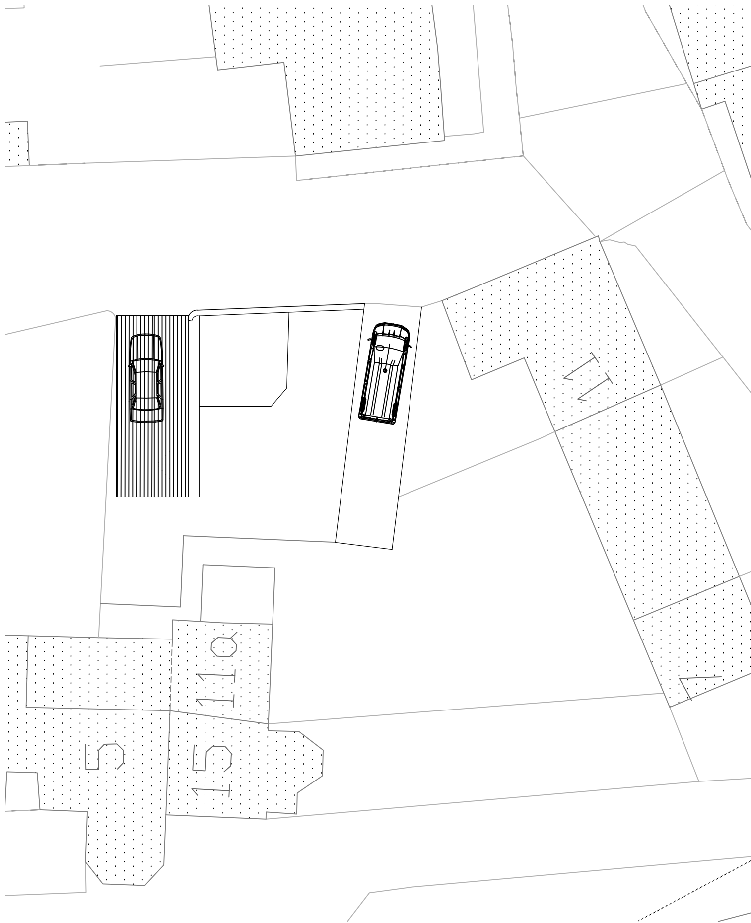
SITE PLAN AS EXISTING