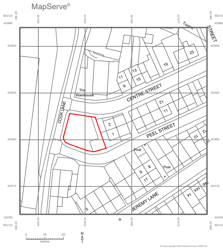
SITE LOCATION PLAN | SCALE 1:1250