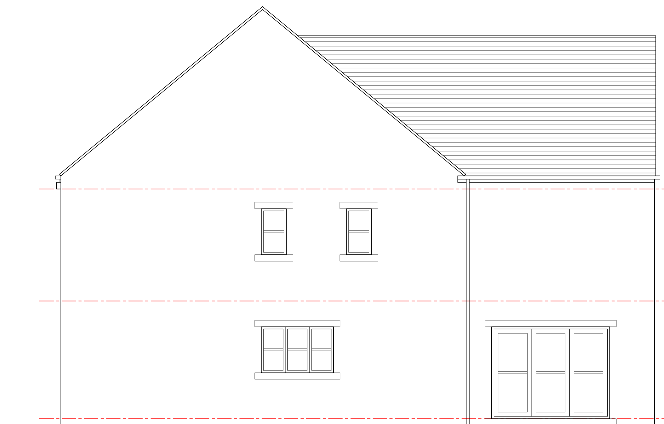
PROPOSED EAST ELEVATION 1:50