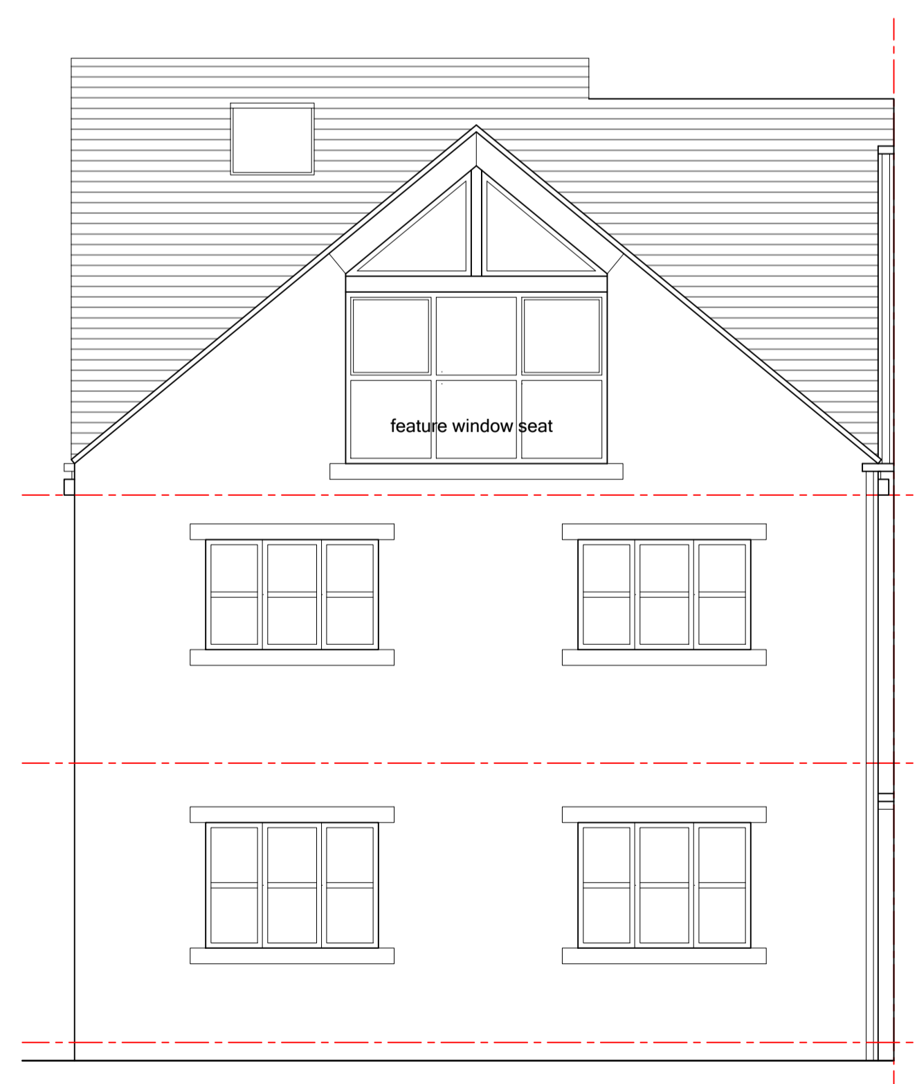
PROPOSED NORTH ELEVATION 1:50

MATERIALS Artificial Stone Walling Concrete Tile Roof