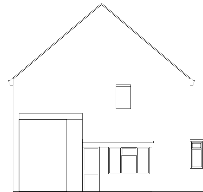
EXISTING OTHER SIDE ELEVATION