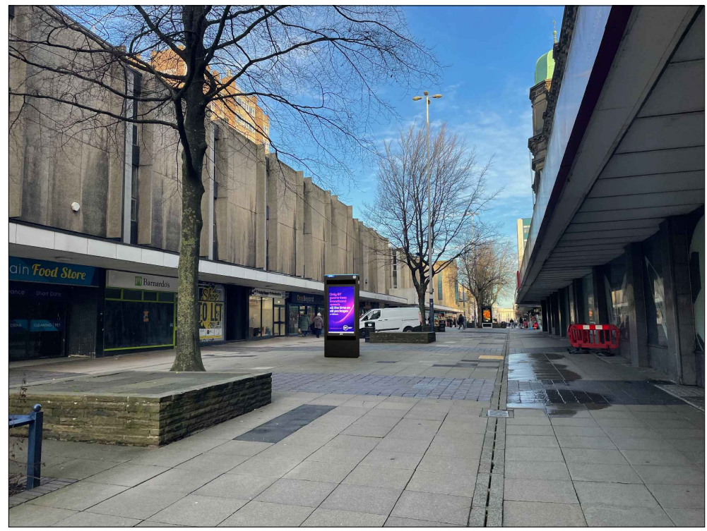
PROPOSED PHOTOMONTAGE NTS