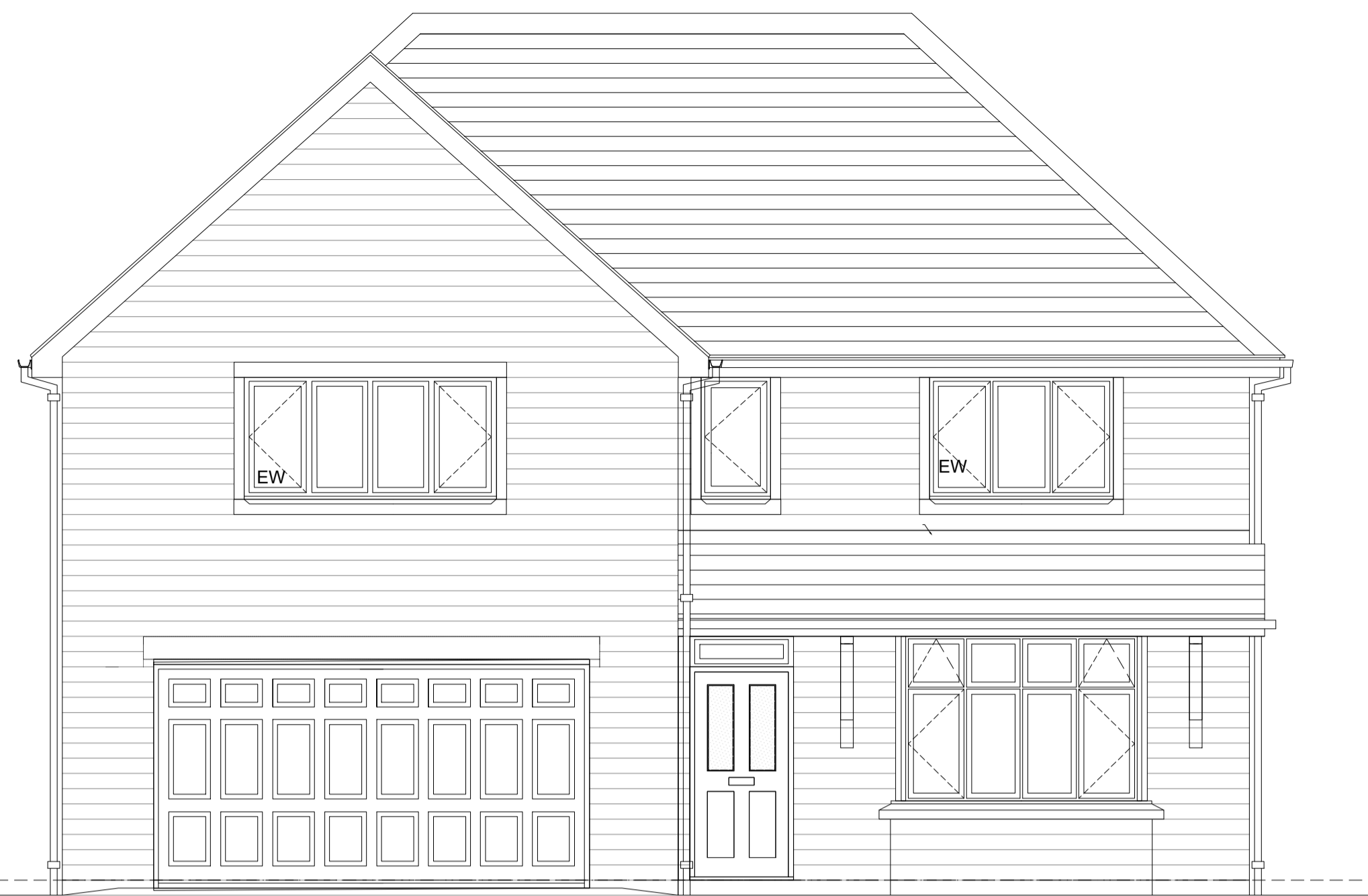
FRONT ELEVATION Scale 1:50