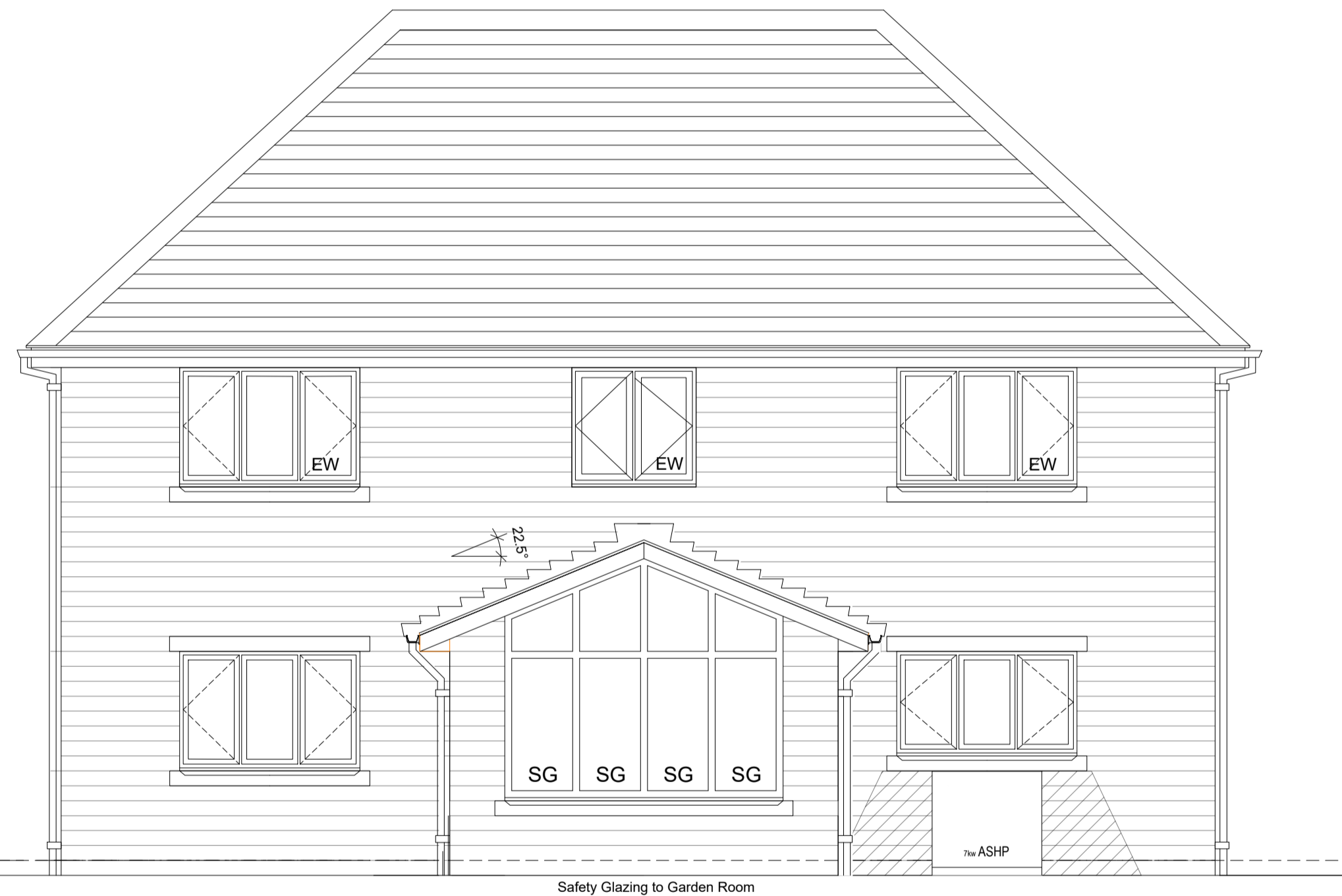
REAR ELEVATION Scale 1:50