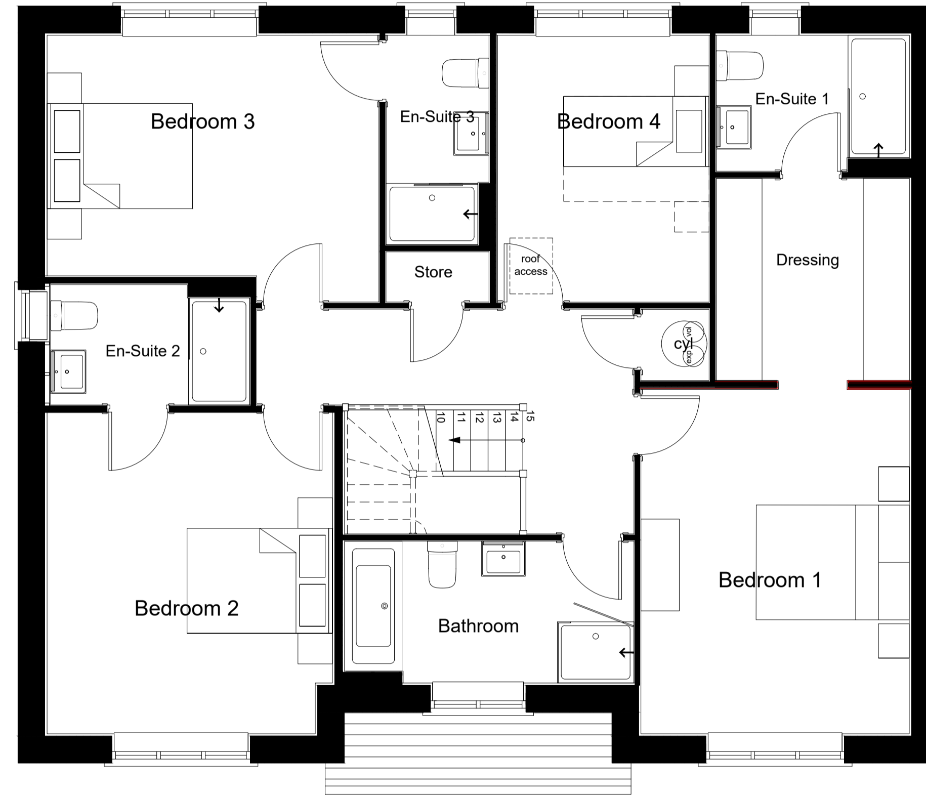
FIRST FLOOR PLAN Scale 1:50