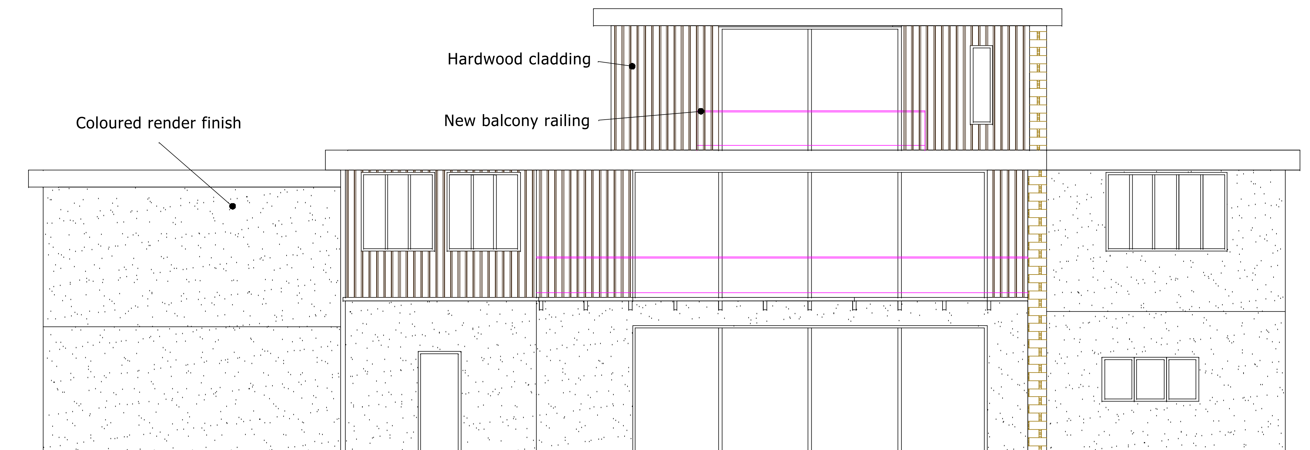
Rear elevation (W)