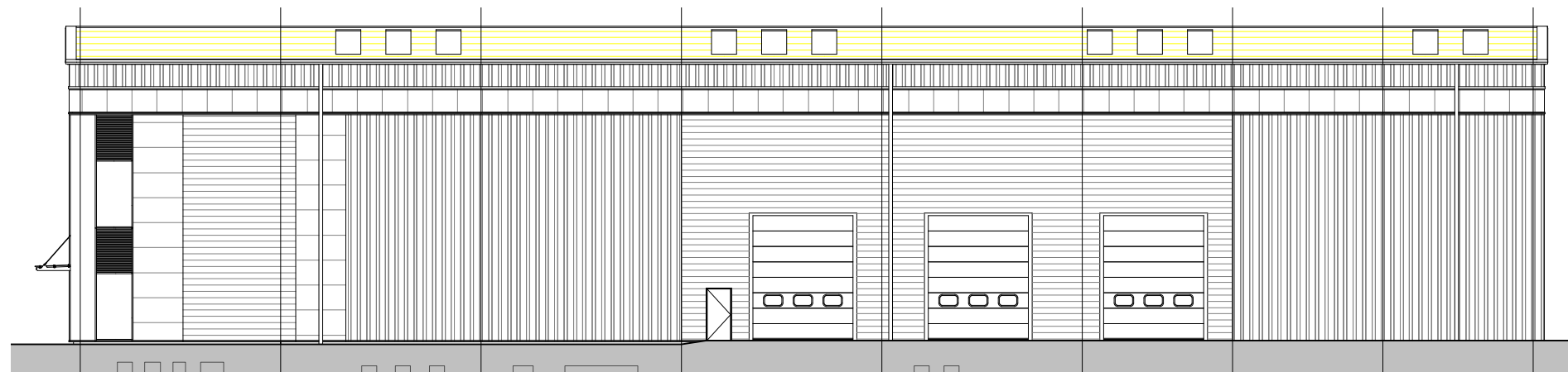
1 Proposed East Elevation Scale 1:250 @ A3