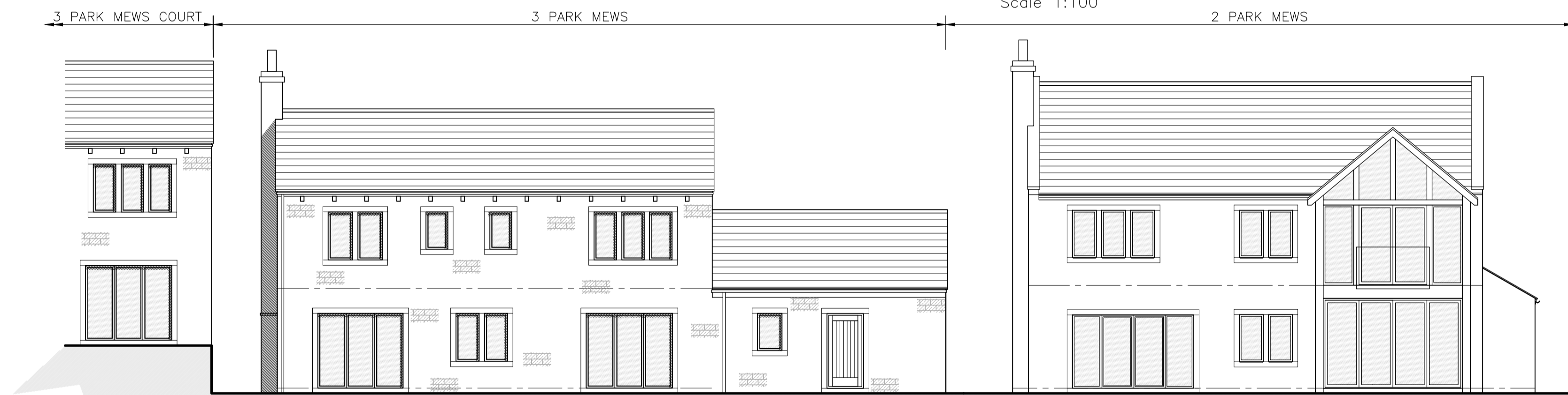
Existing South East Facing Rear Elevation Scale 1:100