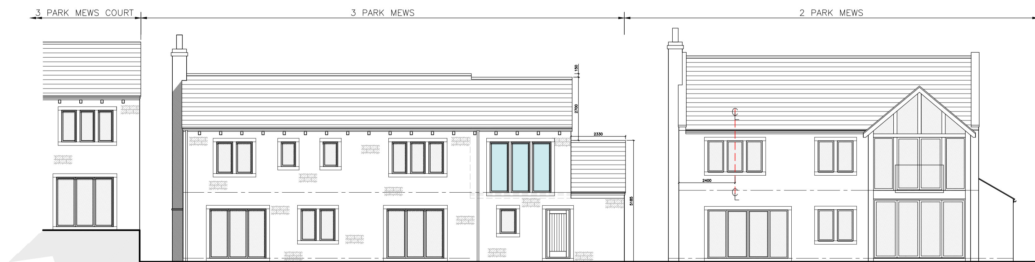
Proposed South East Facing Rear Elevation Scale 1:100