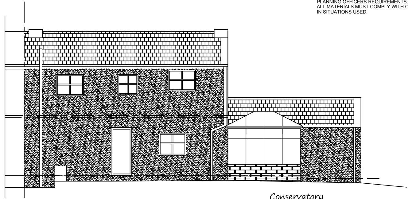
Existing Rear Elevation - South