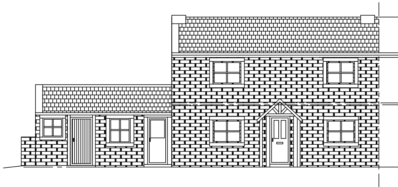
Existing Front Elevation - North

NOTE MATERIALS TO MATCH EXISTING THESE NOTES DO NOT COMPRISE A FULL SPECIFICATION THEY ARE FOR GENERAL GUIDANCE ONLY AND THEIR PRIMARY FUNCTION IS TO ASSIST LOCAL AUTHORITY OFFICERS IN DETERMINING BUILDING REGULATION COMPLIANCE. ALL DIMENSIONS MUST BE CHECKED ON SITE PRIOR TO WORKS STARTING. ALL WORKS MUST BE CARRIED OUT IN ACCORDANCE WITH CURRENT BUILDING REGULATIONS, CODES OF PRACTICE AND PLANNING OFFICERS REQUIREMENTS. ALL MATERIALS MUST COMPLY WITH CURRENT BRITISH STANDARDS IN SITUATIONS USED.