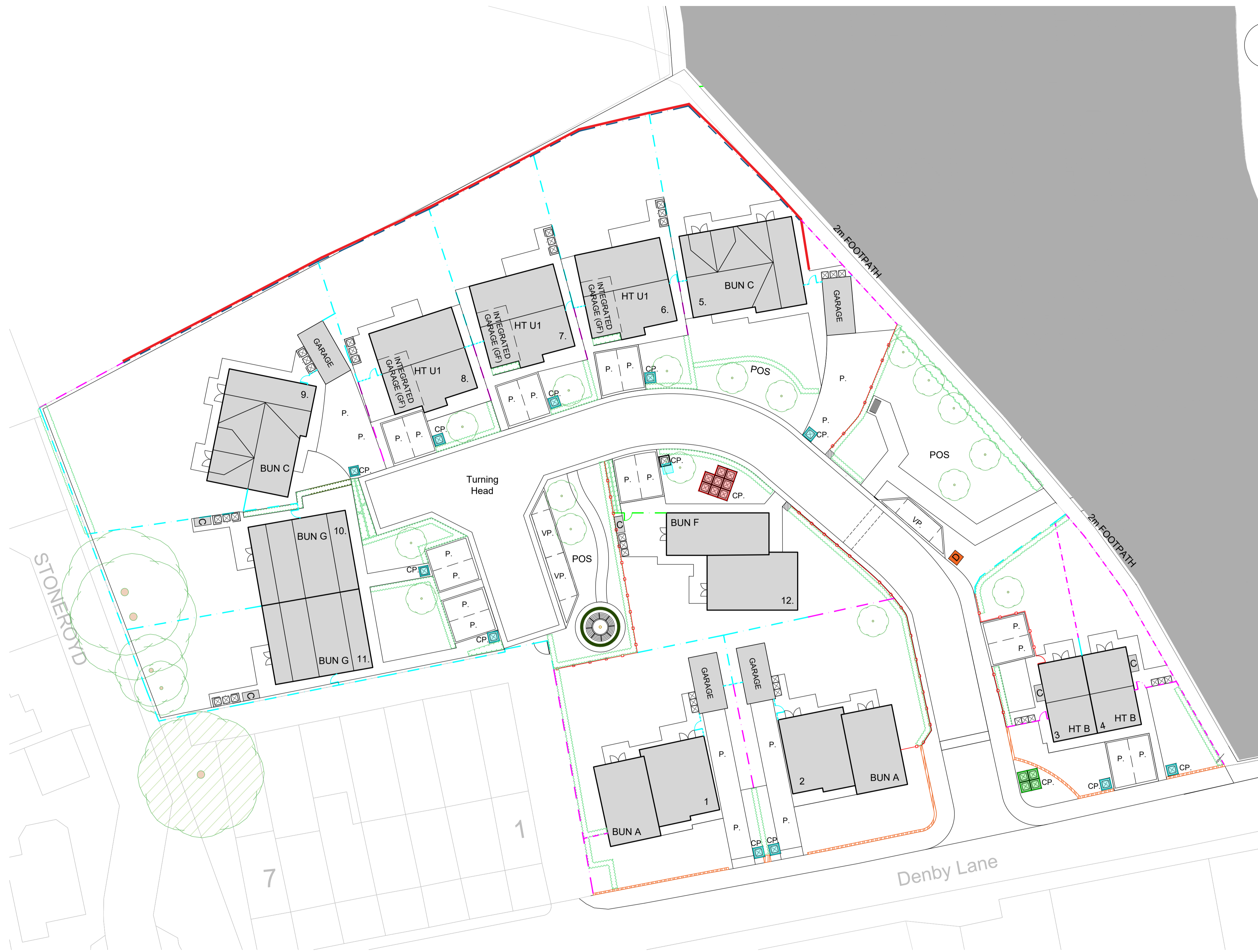
Proposed Bin Store Phasing Plan 1 : 250