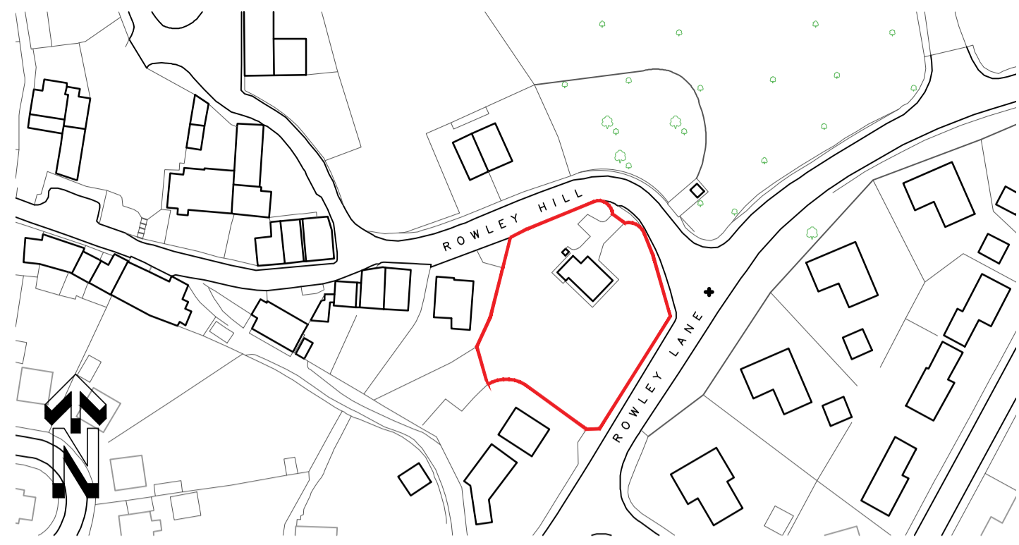
OS PLAN - Scale 1:1250