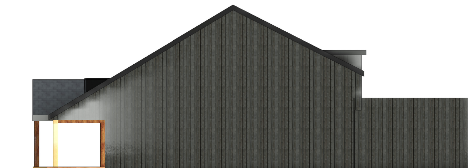
Sider elevation 1:100