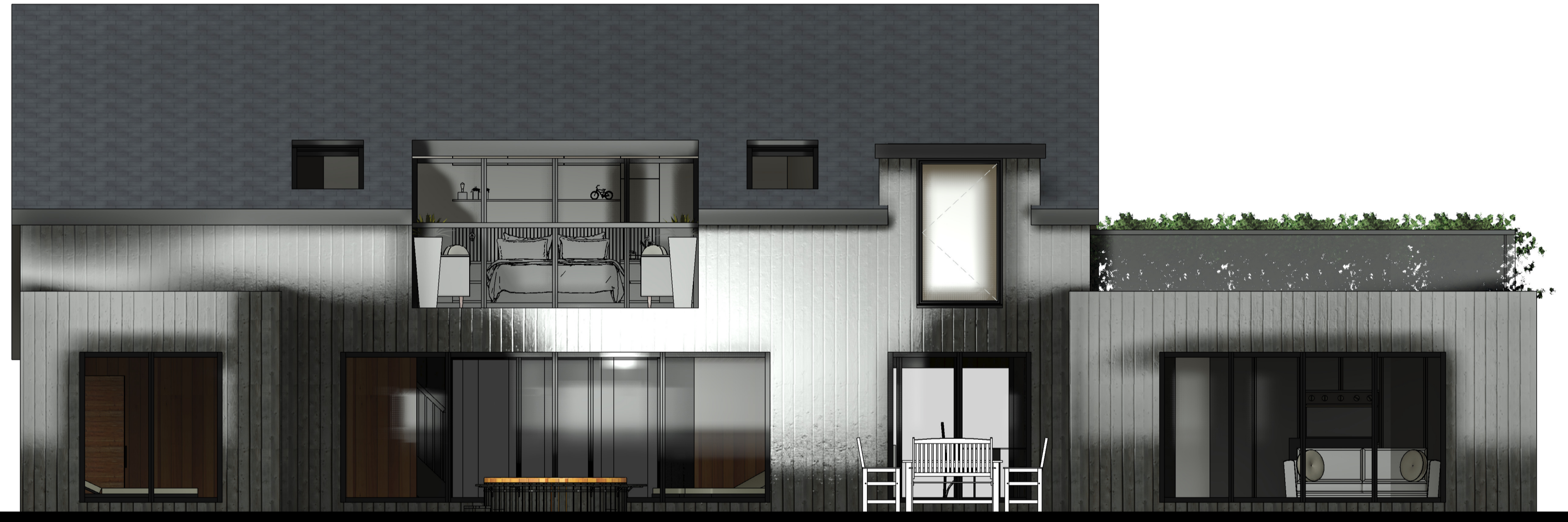
Rear elevation 1:50