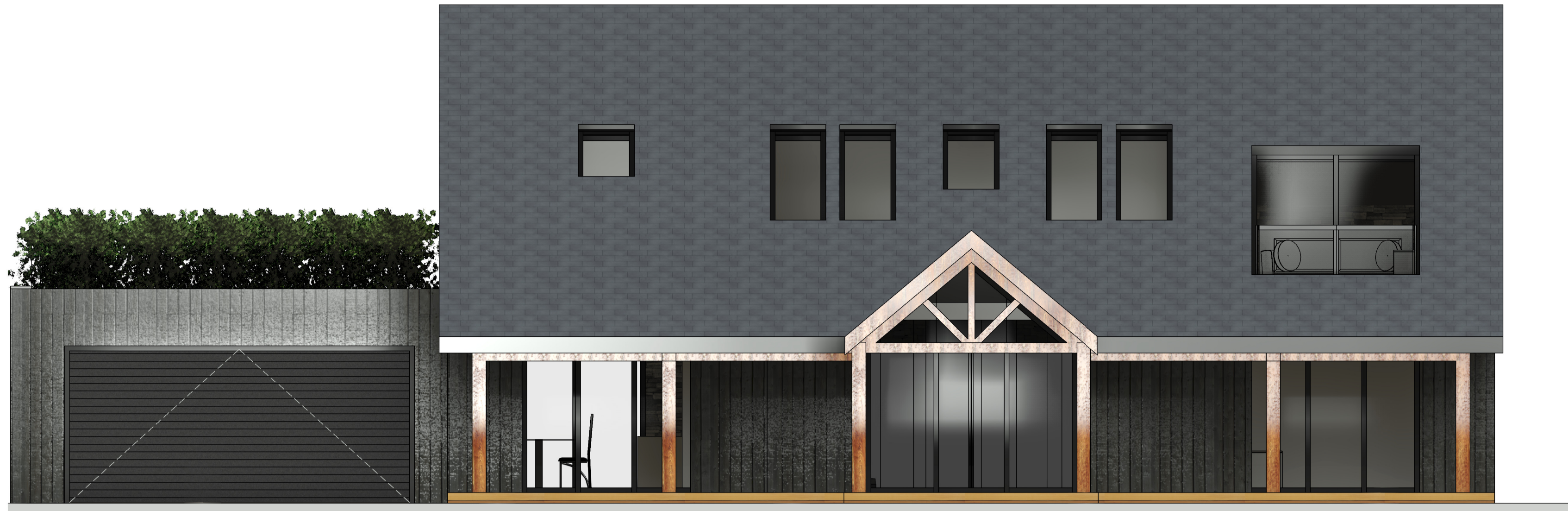
Front elevation 1:50