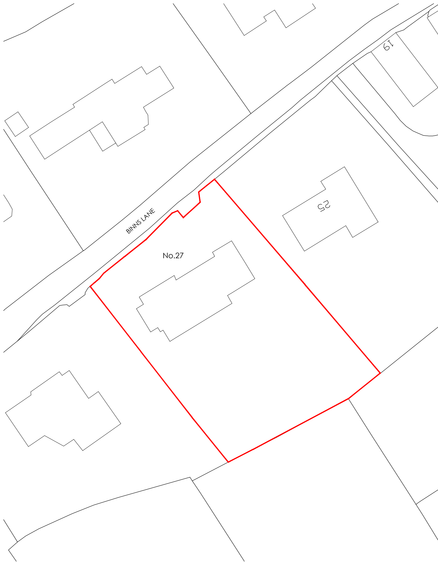
SITE PLAN AS EXISTING