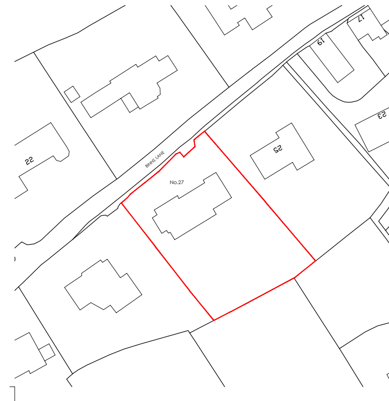
LOCATION PLAN AS EXISTING