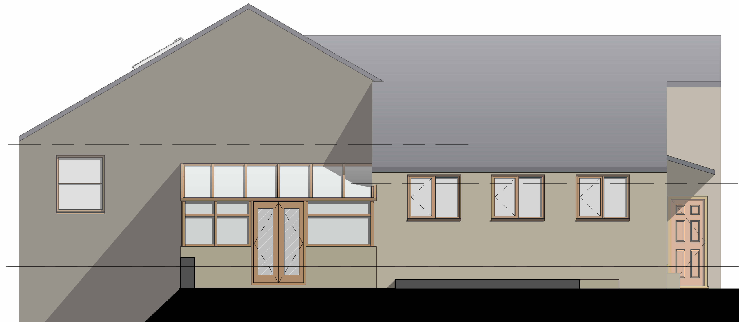
EXISTING WEST ELEVATION 1:100