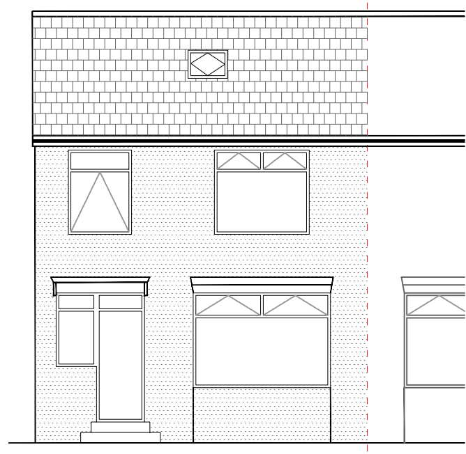
PROPOSED FRONT ELEVATION (East)