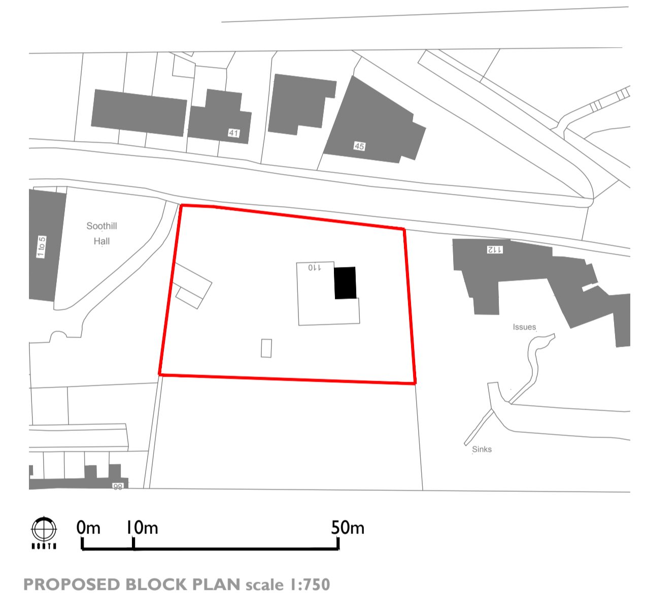
PROPOSED BLOCK PLAN scale 1:750