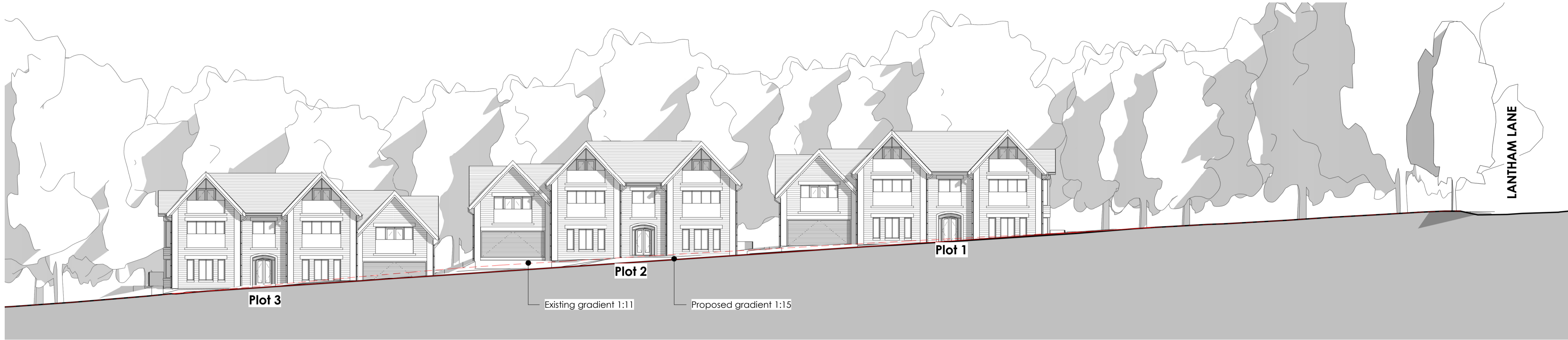
Street Scene A-A