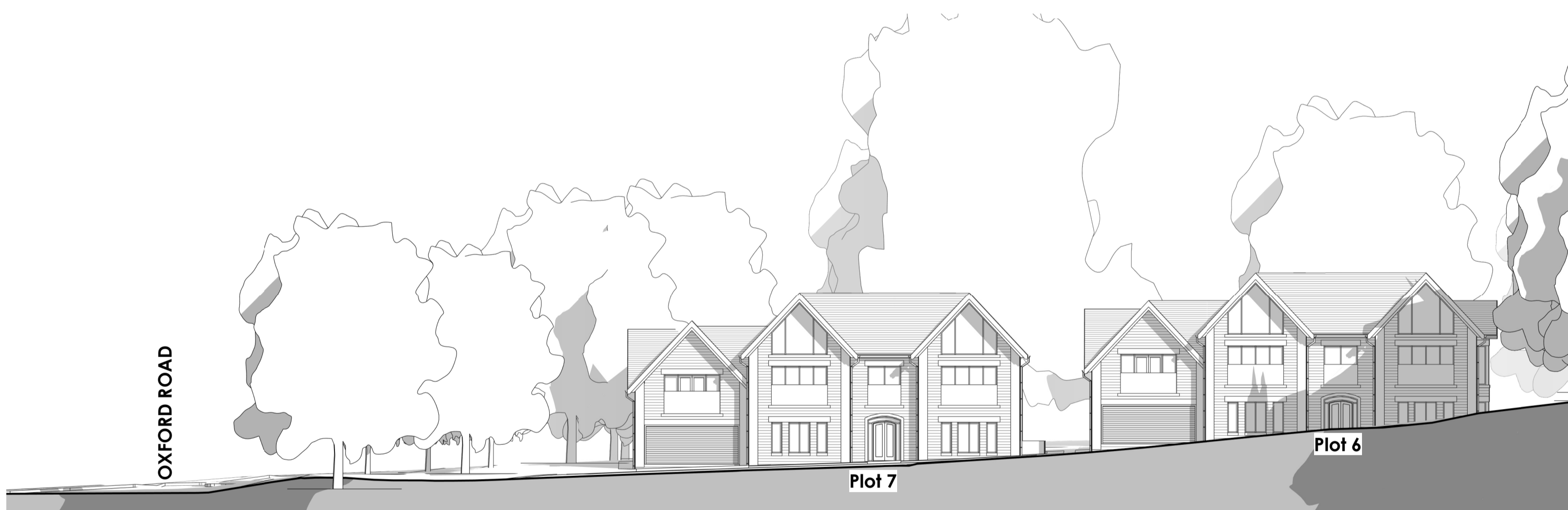
Street Scene C-C