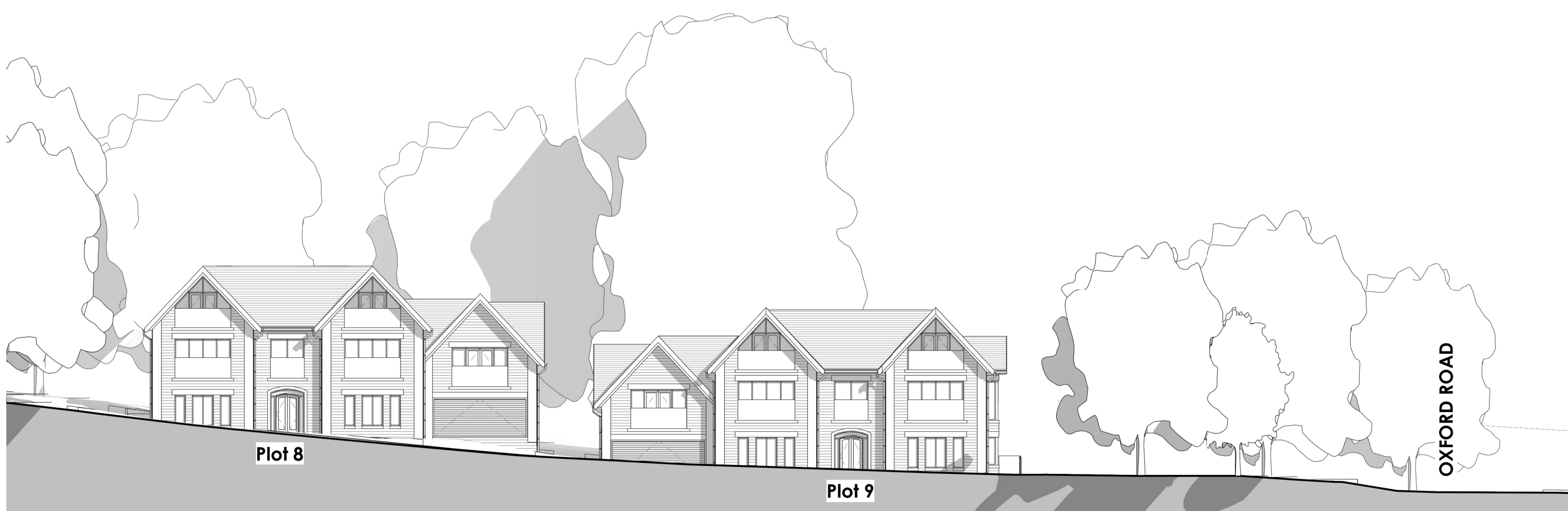
Street Scene D-D