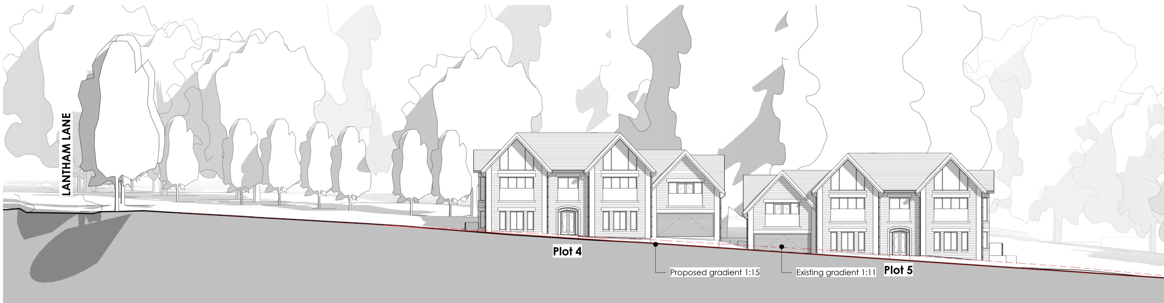
Street Scene B-B