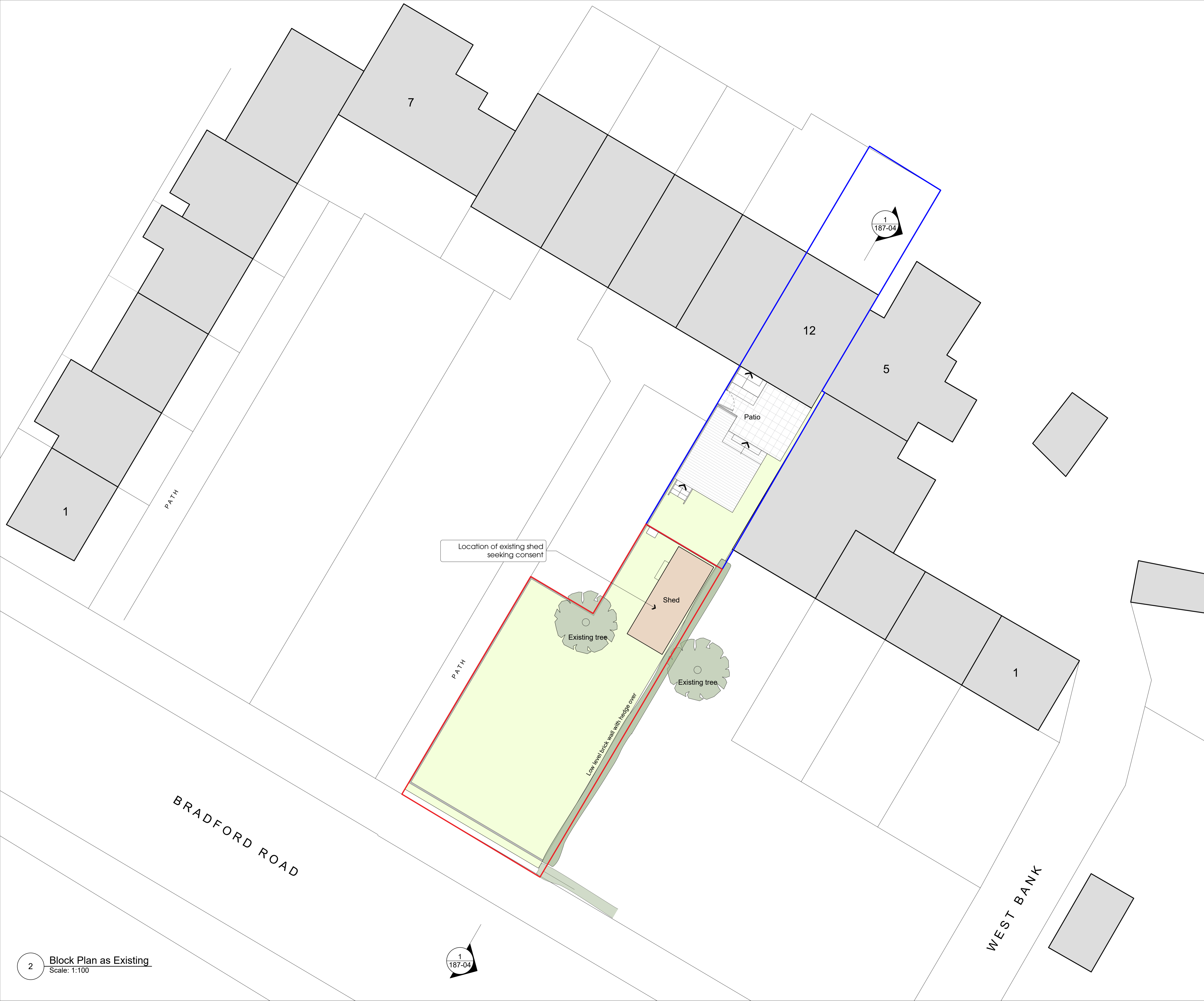
2 Block Plan as Existing Scale: 1:100