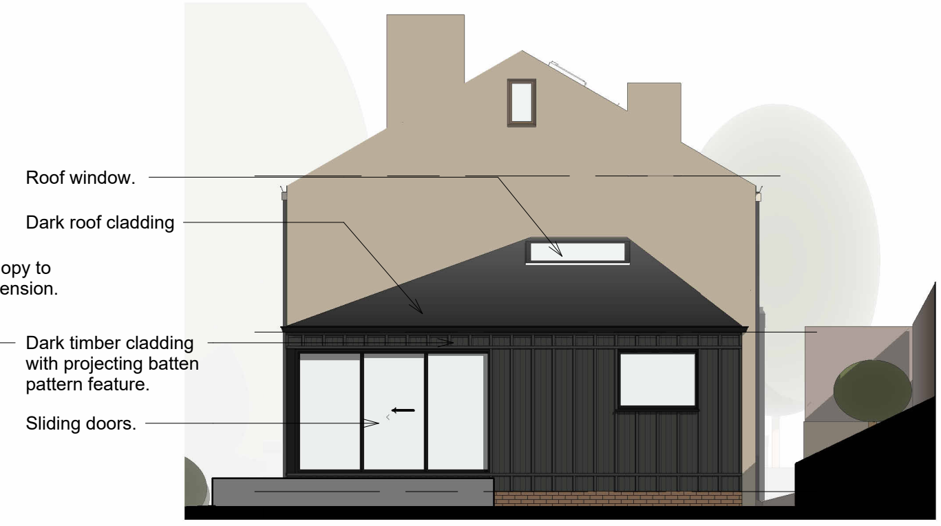
PROPOSED NORTH EAST ELEVATION 1:100