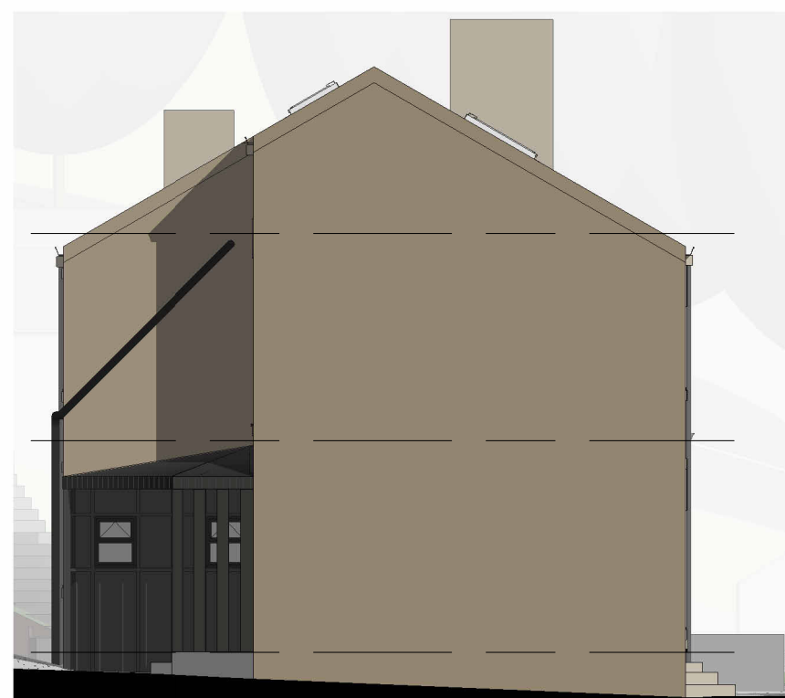
PROPOSED SOUTH WEST ELEVATION 1:100