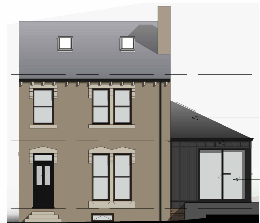
PROPOSED SOUTH EAST ELEVATION 1:100