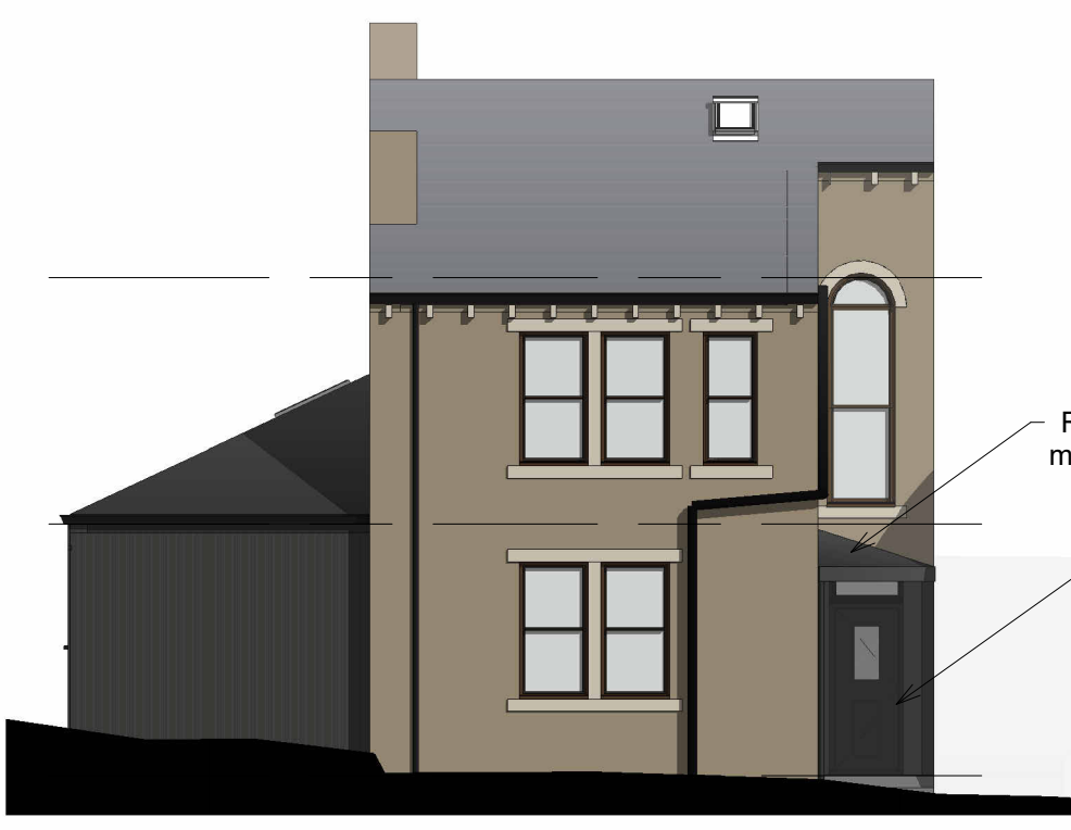
PROPOSED NORTH WEST ELEVATION 1:100