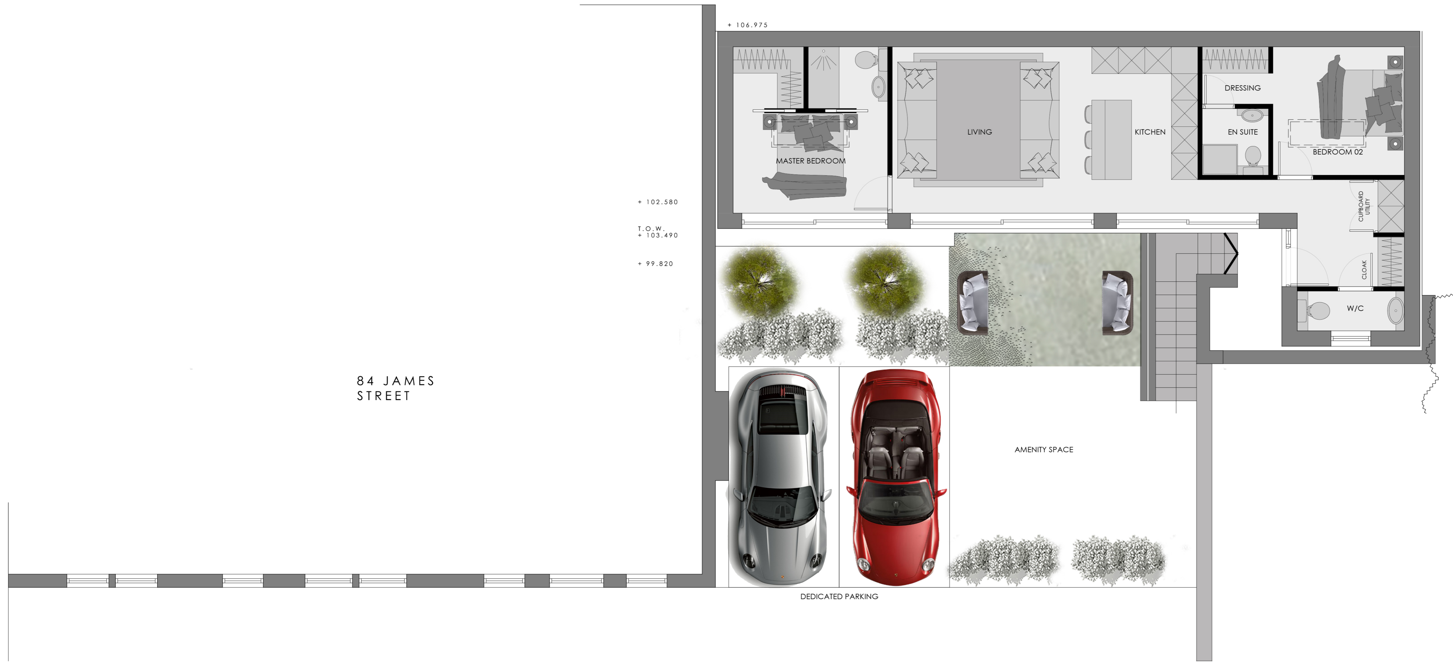
UPPER GROUND FLOOR PLAN AS PROPOSED Scale 1:50

Note: Information is based on OS map and received information and is subject to full topographical survey. Assumed site boundary and site constraints subject to legal confirmation. All Legal easements and extent of existing underground services locations are subject to confirmation.