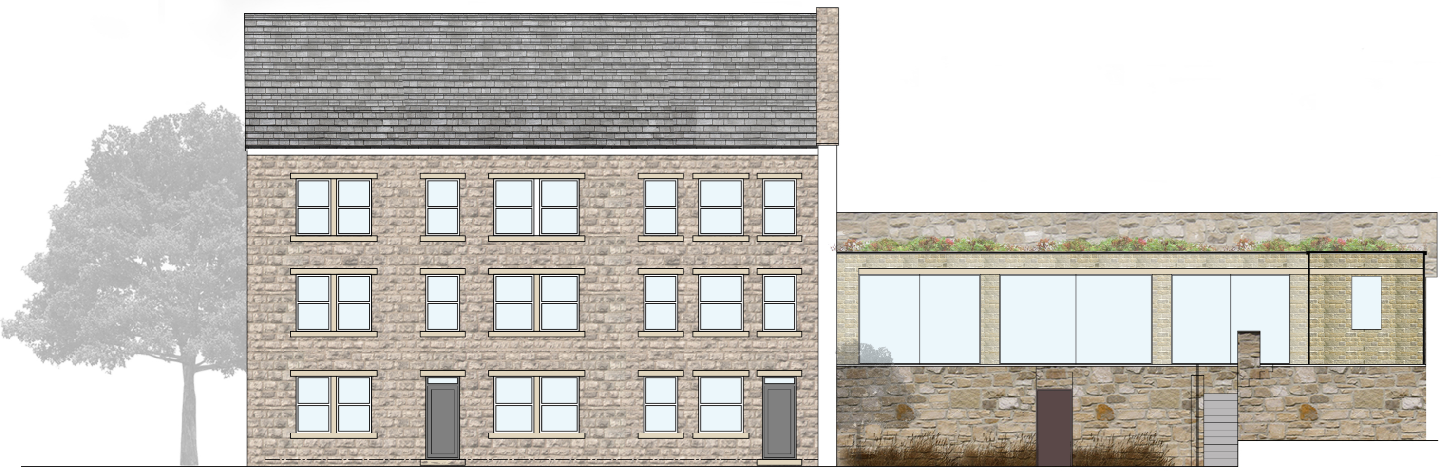
FRONT ELEVATION [Facing North] AS PROPOSED Scale 1:100