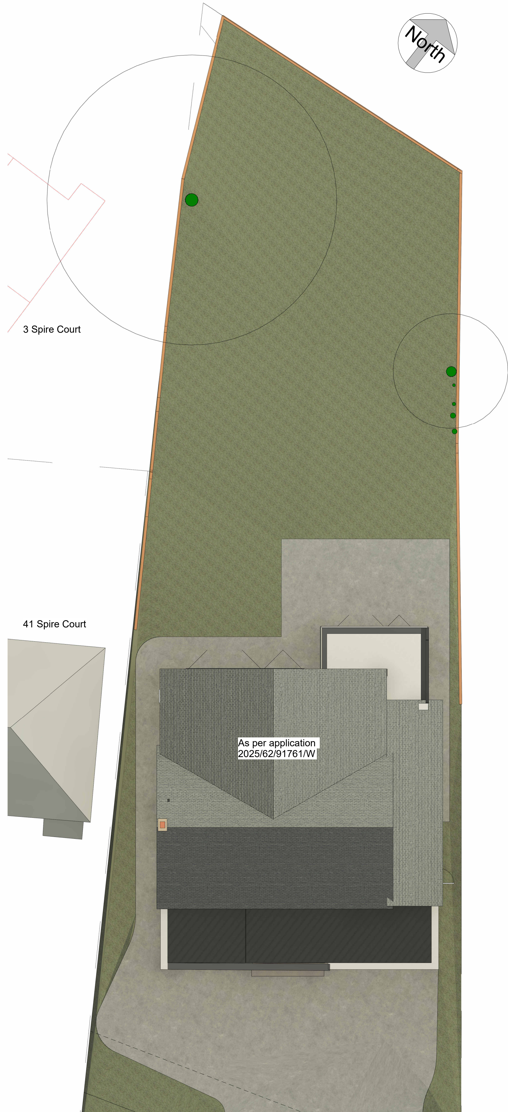
SITE PLAN AS EXISTING 1 : 100