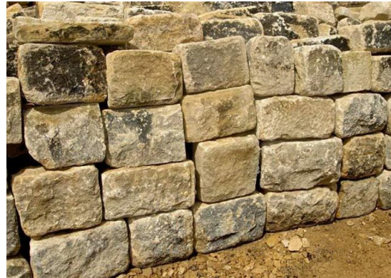
Image of proposed stone

Facing block work – Coursed Yorkstone Reclaimed Sandstone Walling (RG 372-Y-RC)