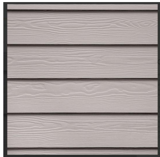
Image of proposed cladding

Cedral Lap Cladding – Colour Clay Brown C03