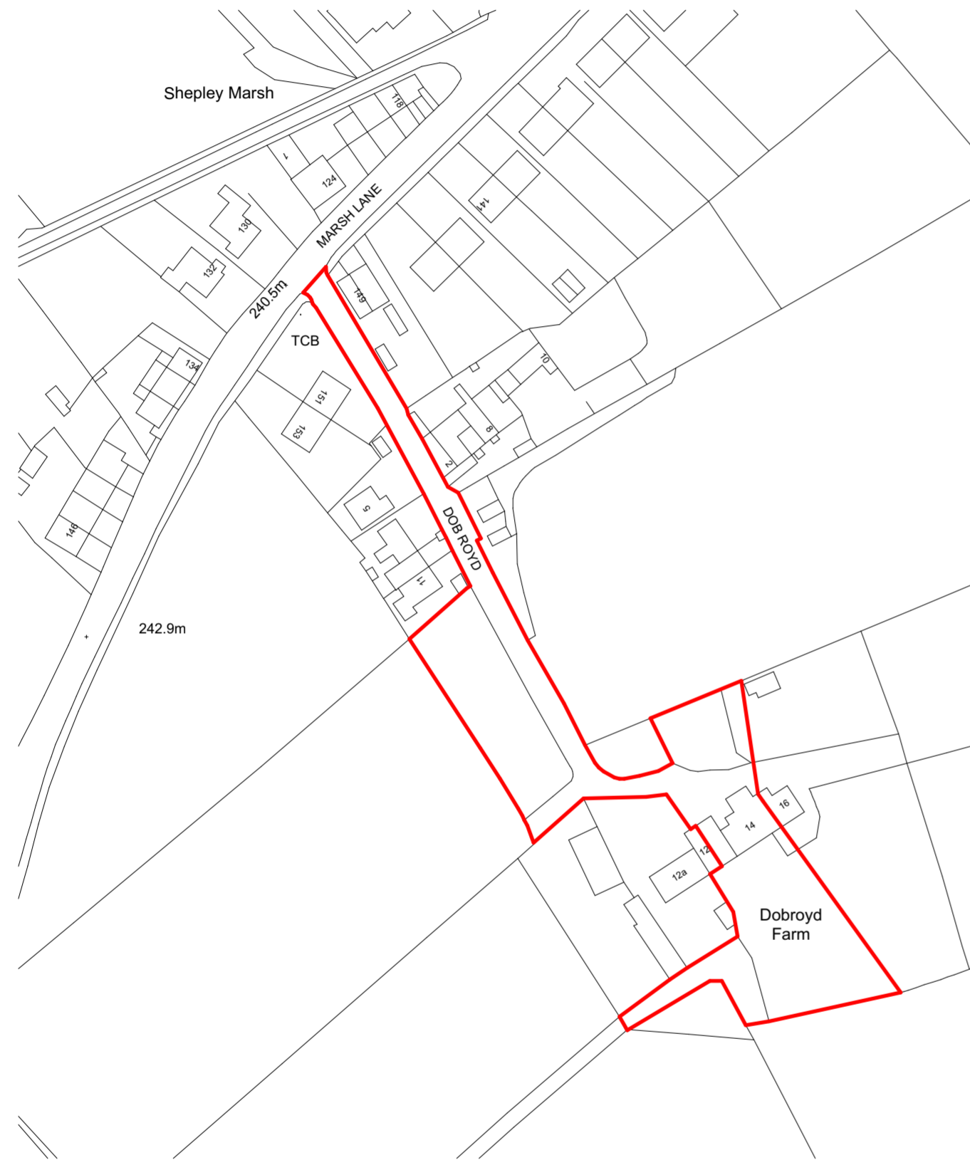
OS Plan - 1:1250