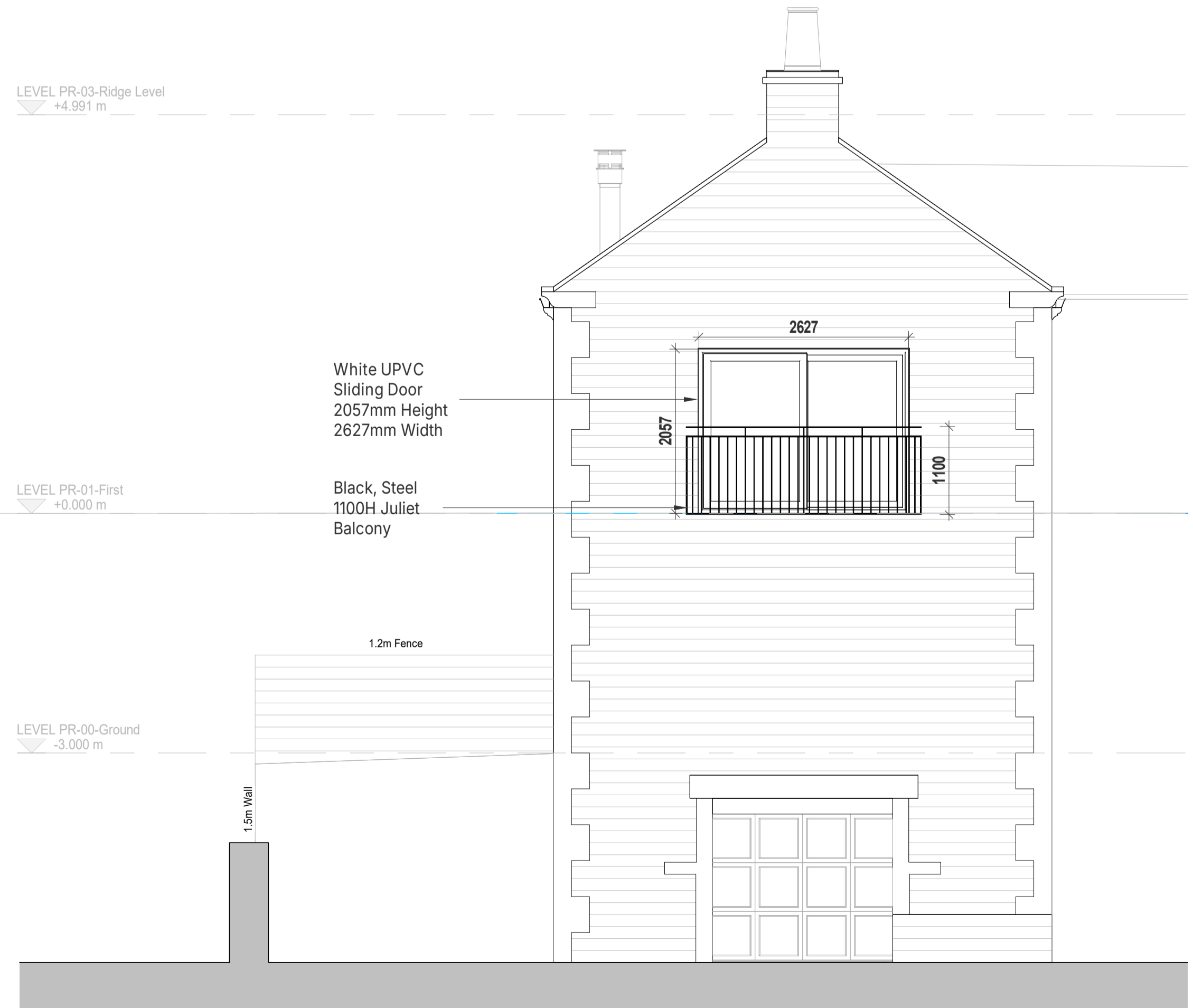
South Elevation - A 1 : 50