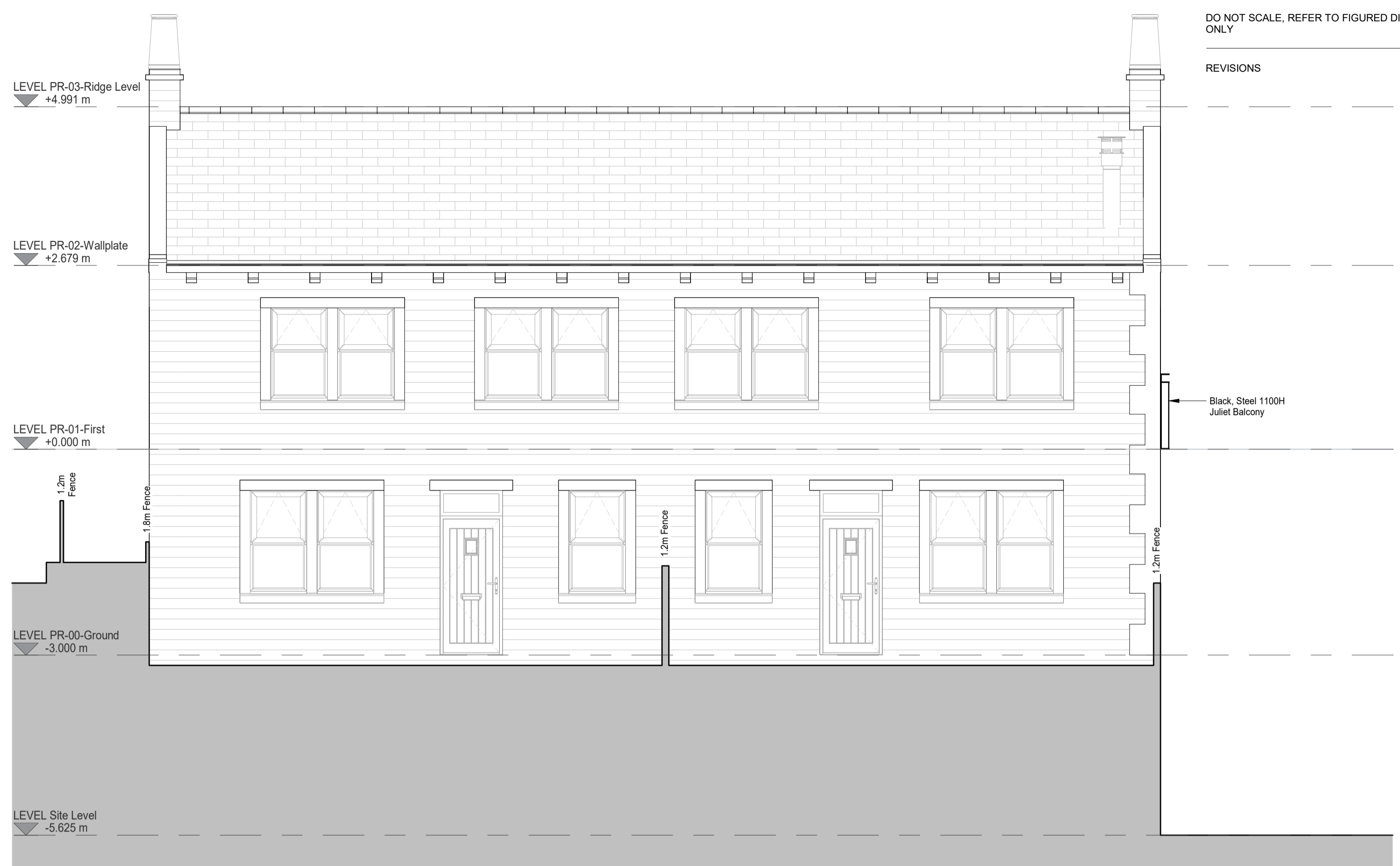
West Elevation - B 1 : 50