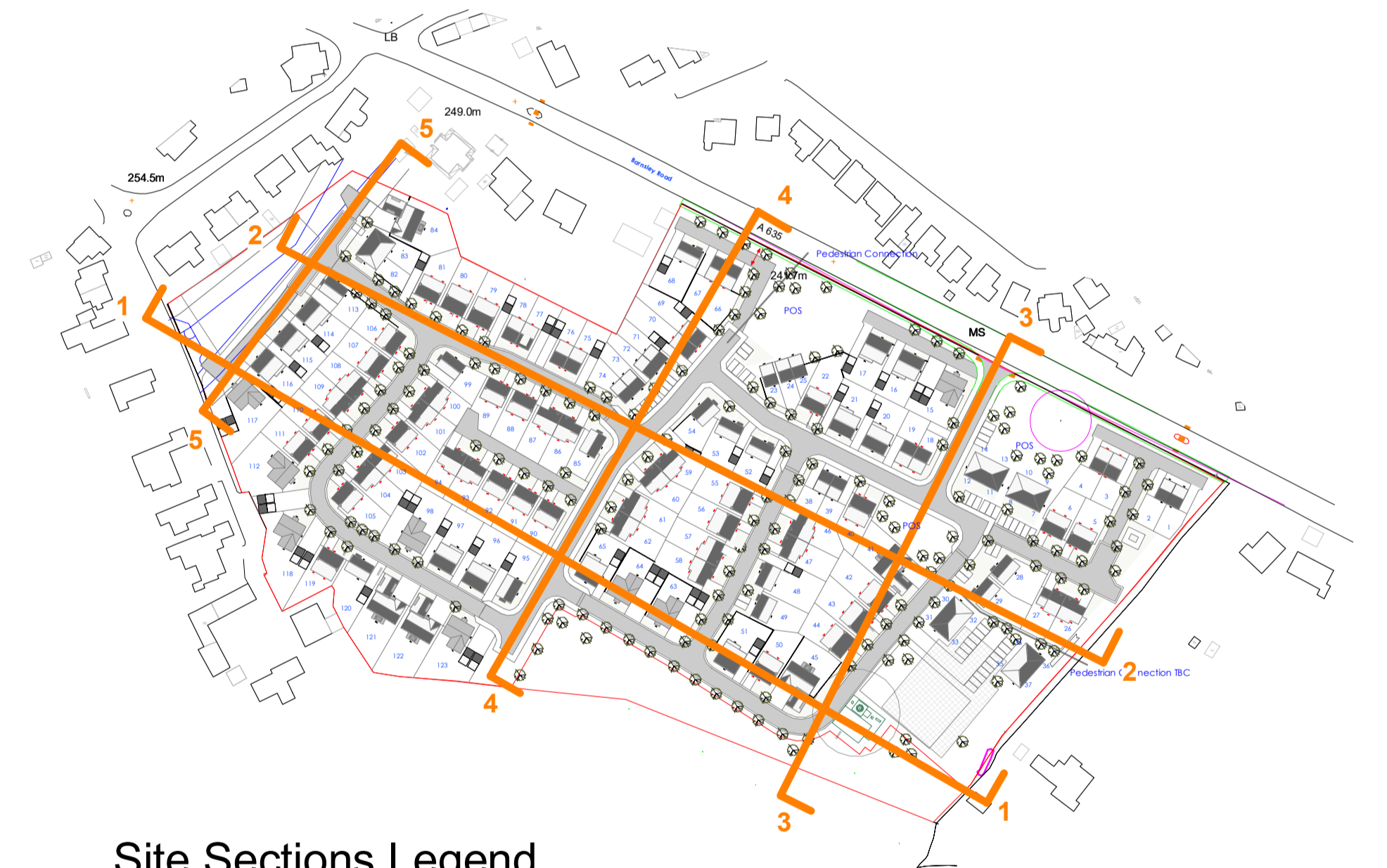
Site Sections Legend 1 : 2000