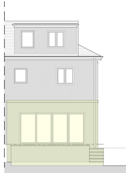
REAR ELEVATION - EXISTING / PROPOSED 1:50