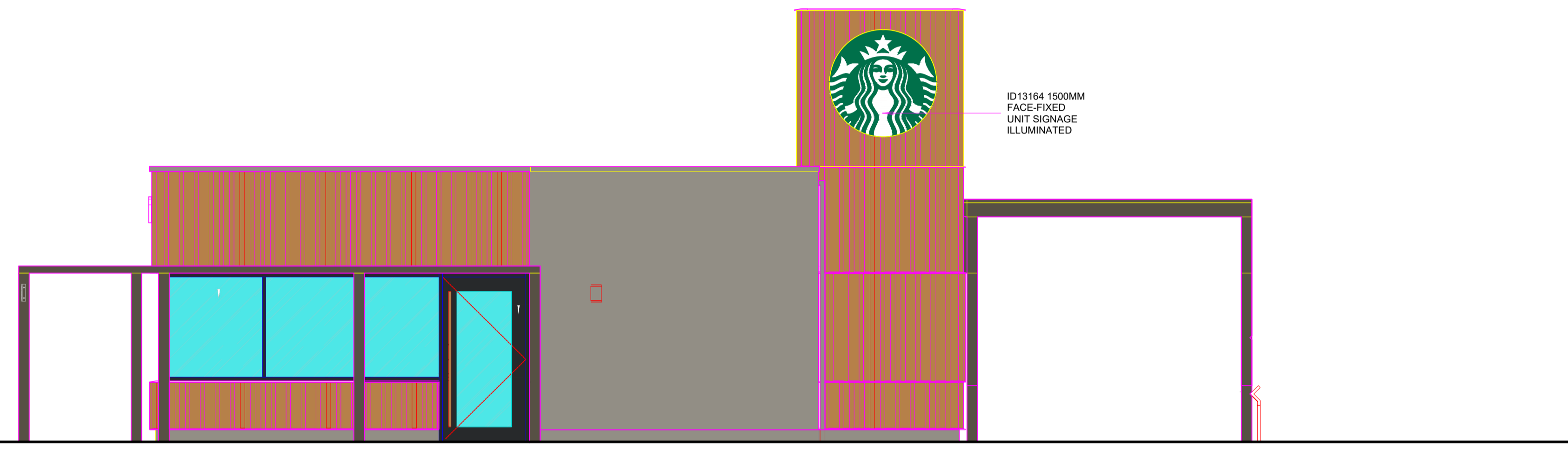
Proposed Side (patio) Elevation B scale - 1:50 @ A1 / 1:100 @ A3