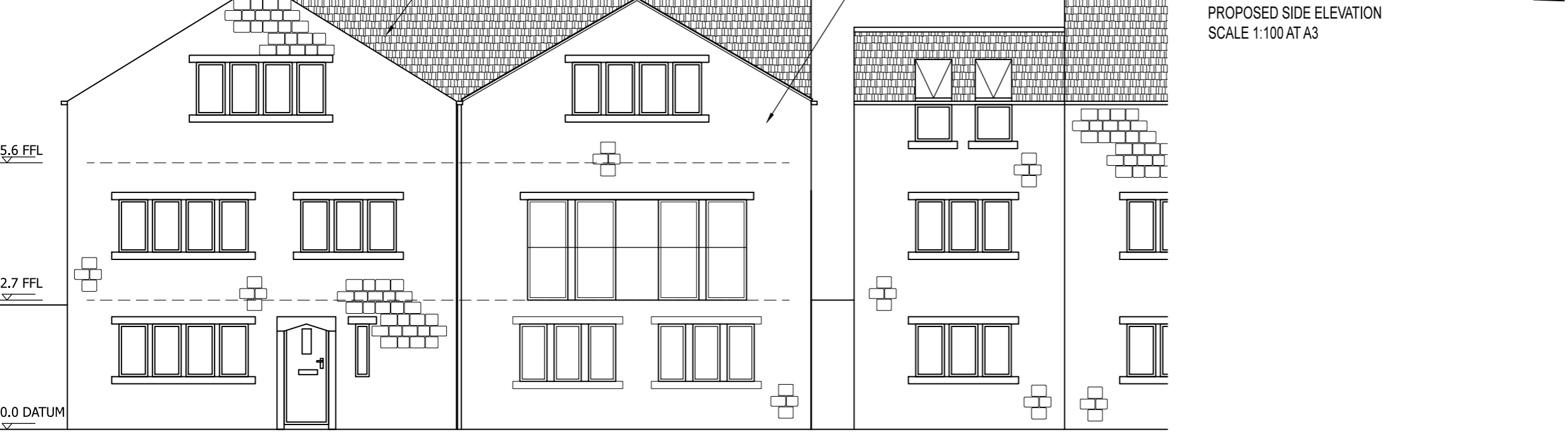
PROPOSED FRONT ELEVATION SCALE 1:100 AT A3