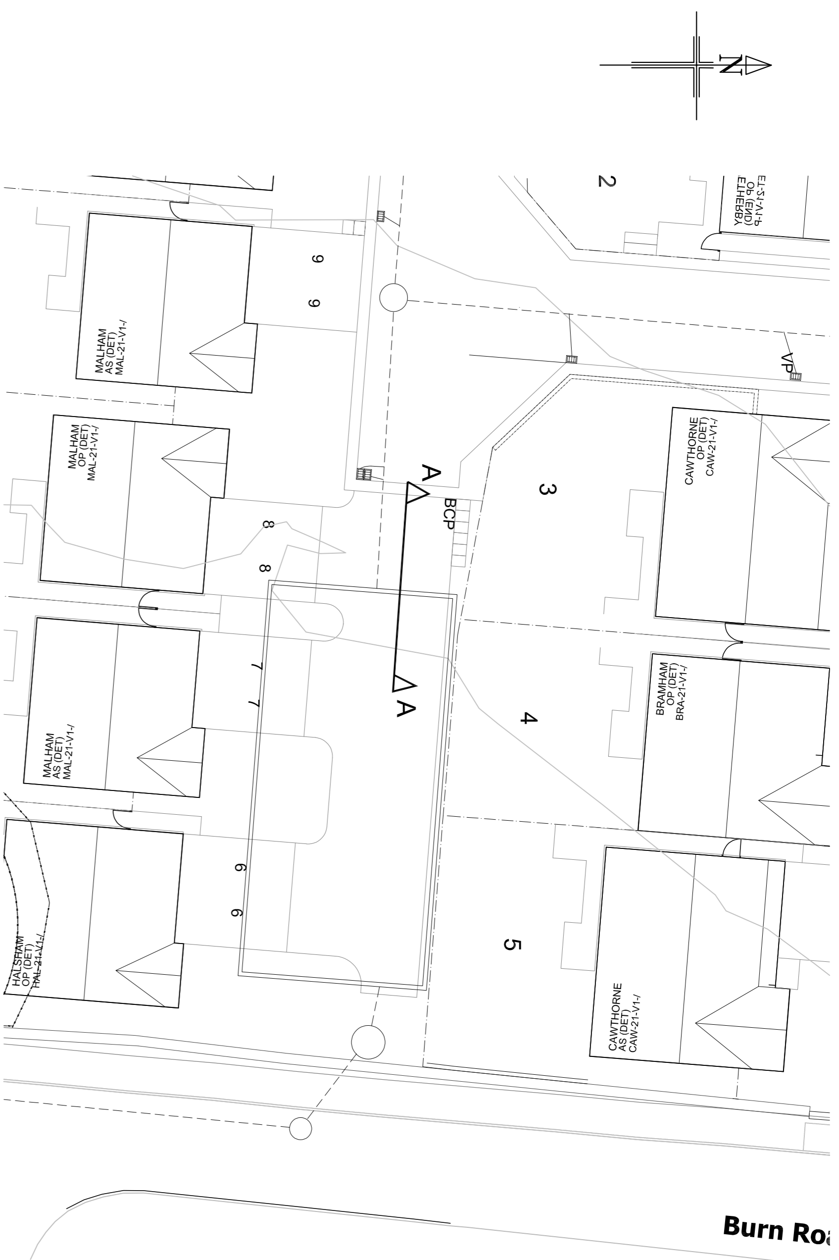
SECTION LOCATION PLAN SCALE 1:200