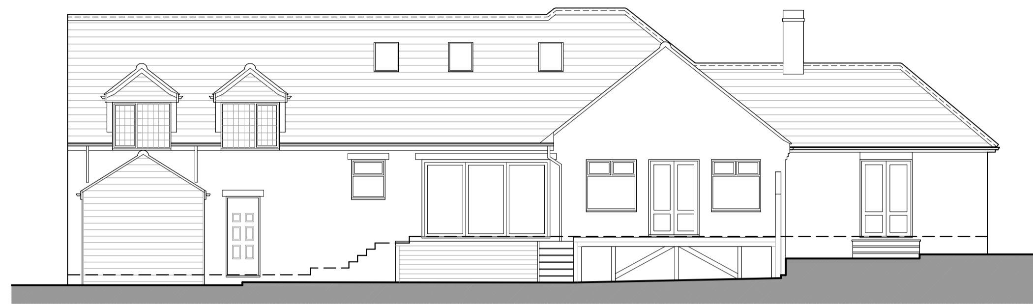
Existing North Elevation, 1:100