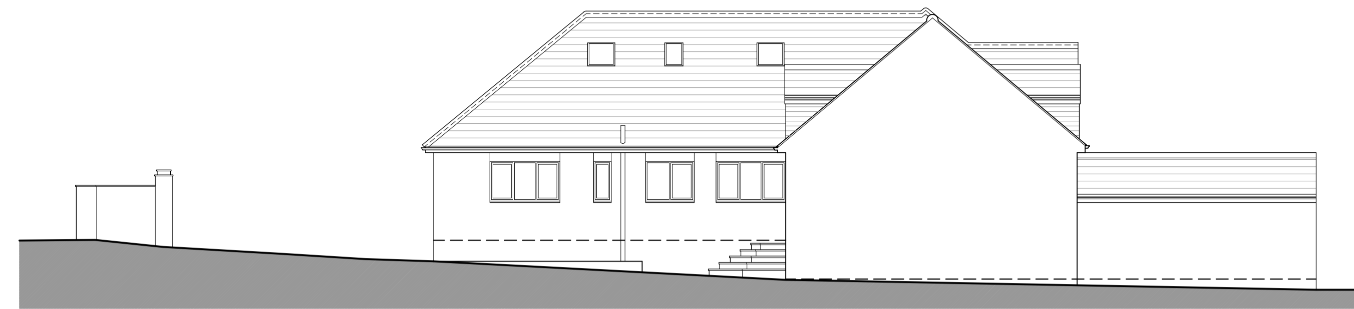
Existing East Elevation, 1:100