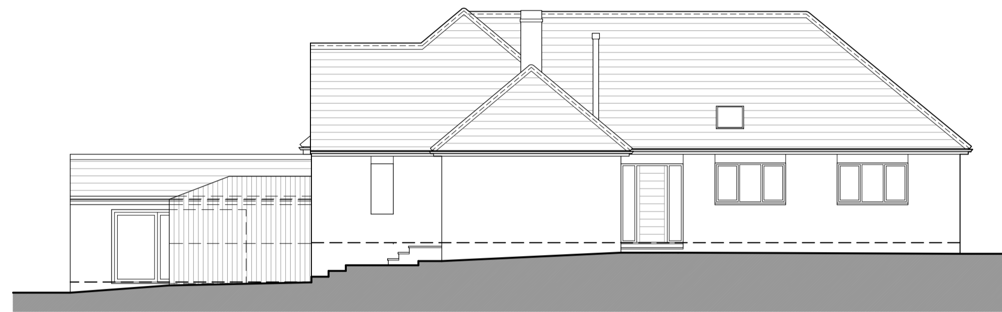
Existing West Elevation, 1:100