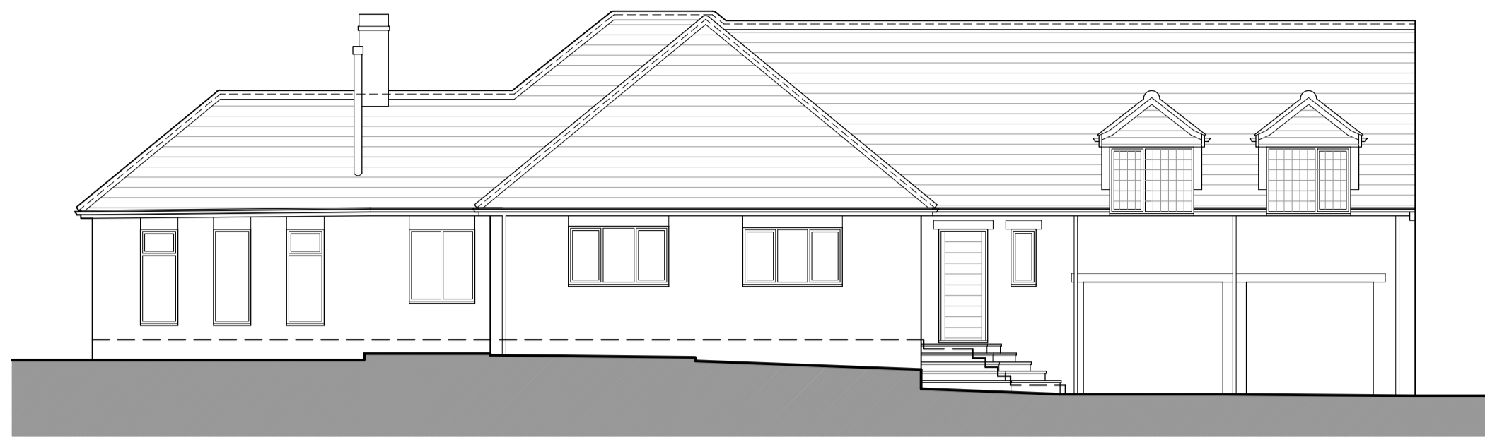
Existing South Elevation, 1:100