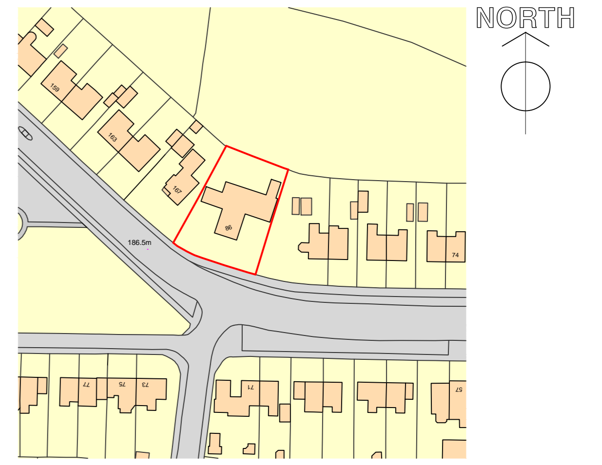
Orthomaps Survey. Site Location Plan, 1:1250