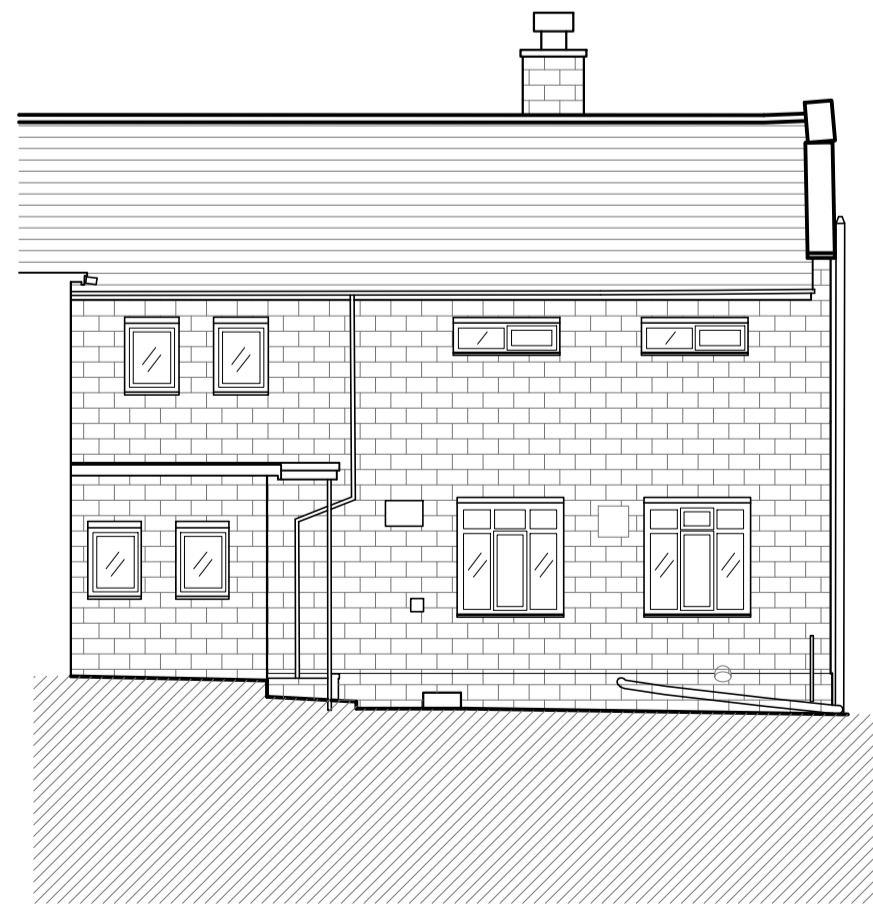
As Built Elevation - 2A Scale 1:100 @ A1