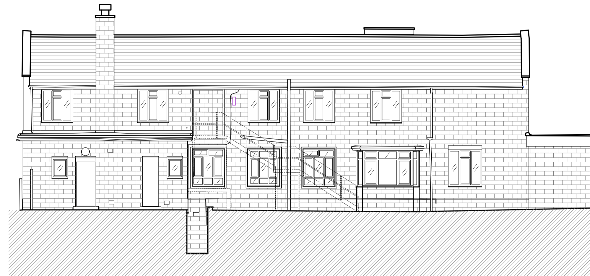
As Built Elevation - 4 Scale 1:100 @ A1