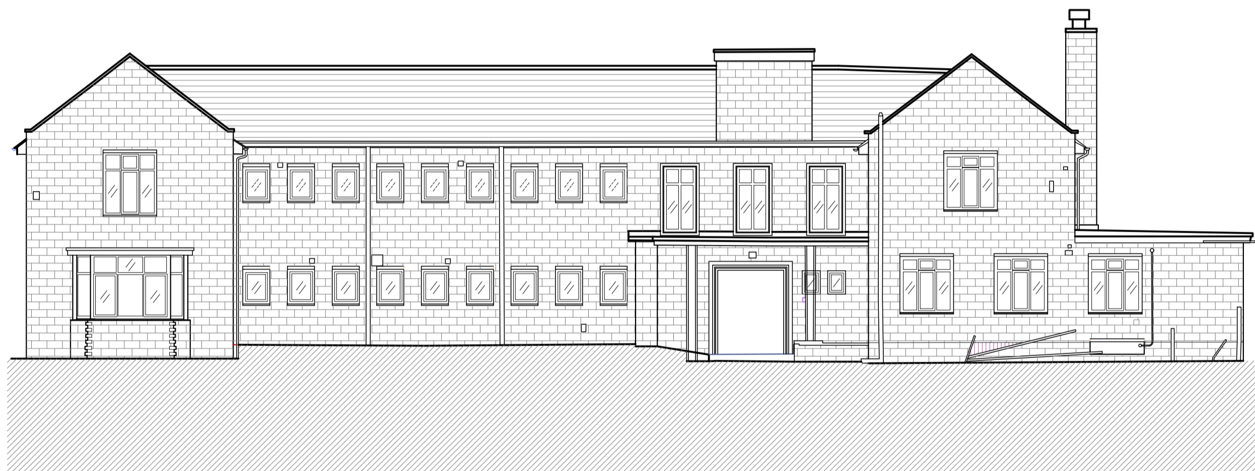
As Built Elevation - 3 Scale 1:100 @ A1