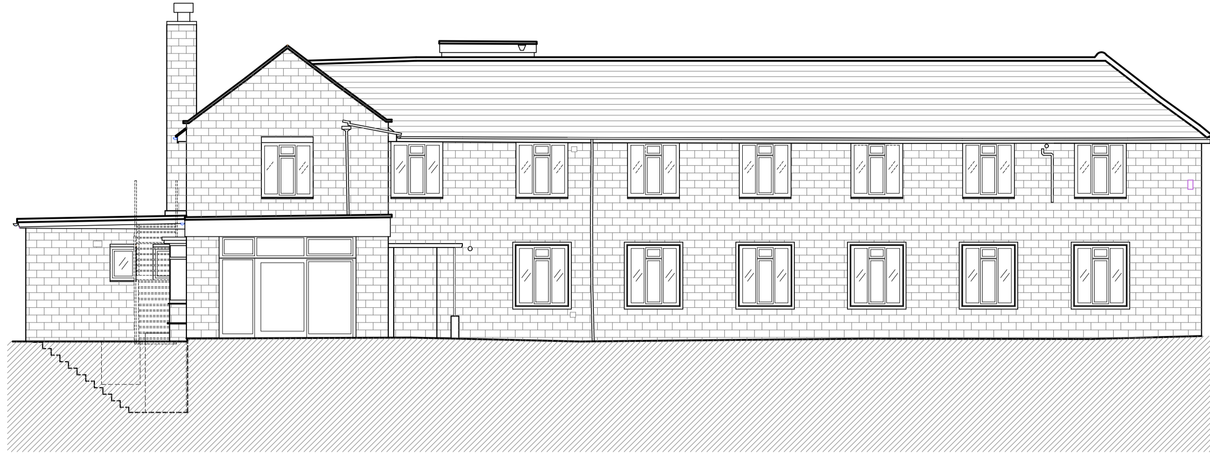
As Built Elevation - 1 Scale 1:100 @ A1