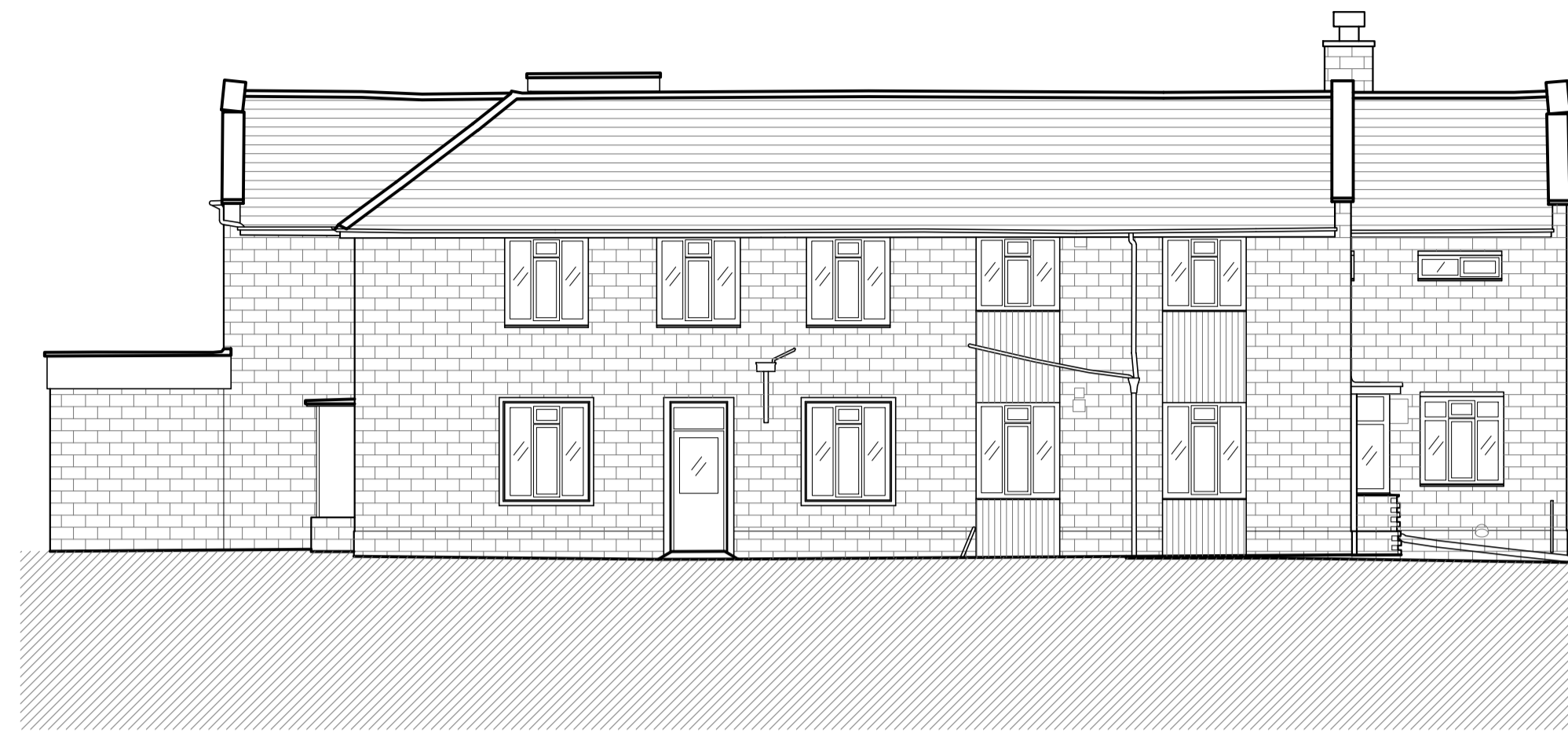
As Built Elevation - 2 Scale 1:100 @ A1