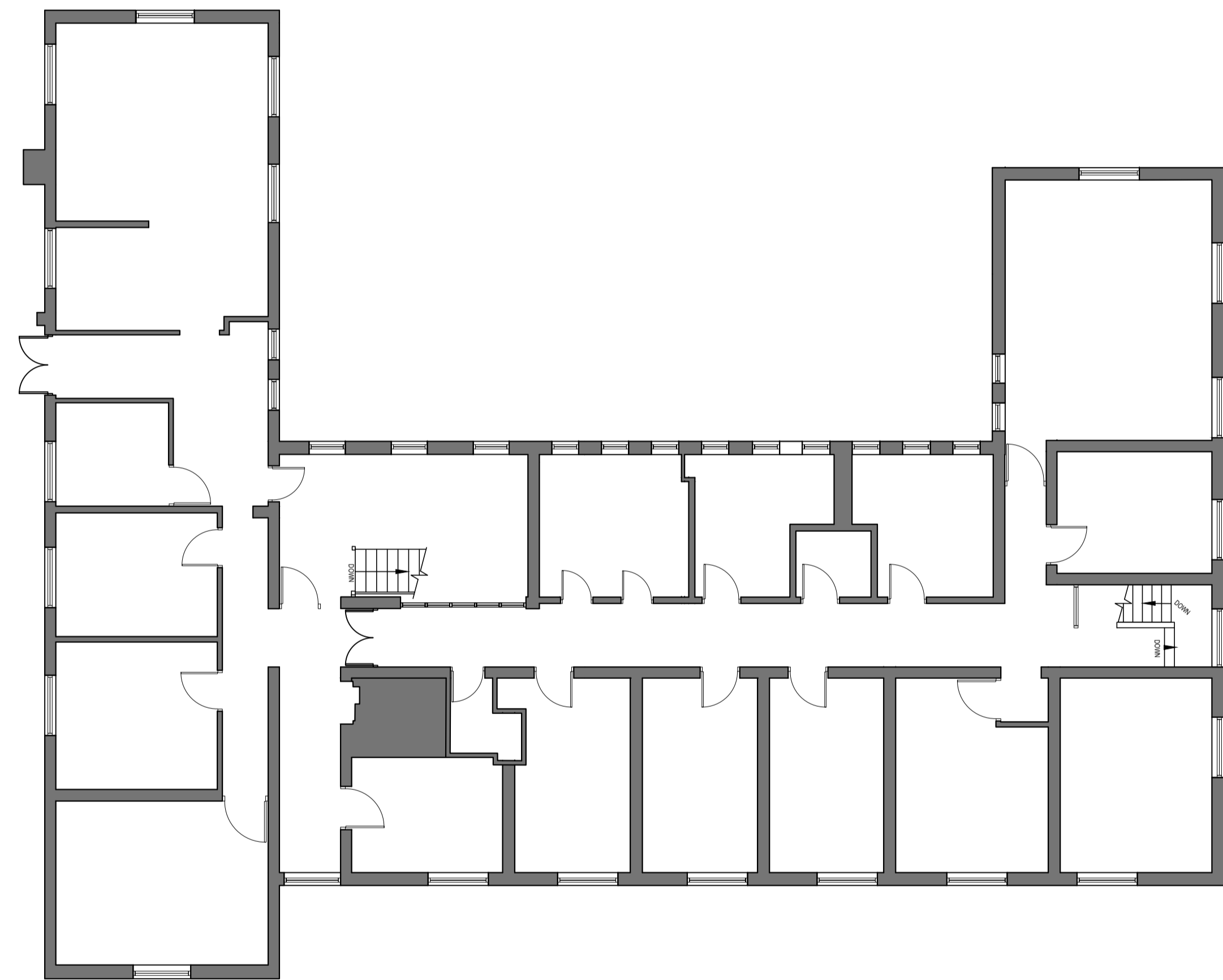
Existing First Floor Plan Scale 1:100 @ A1